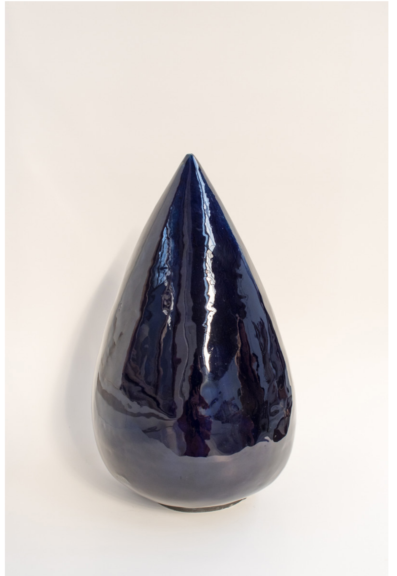
Stoneware sculpture, glaze 41x23