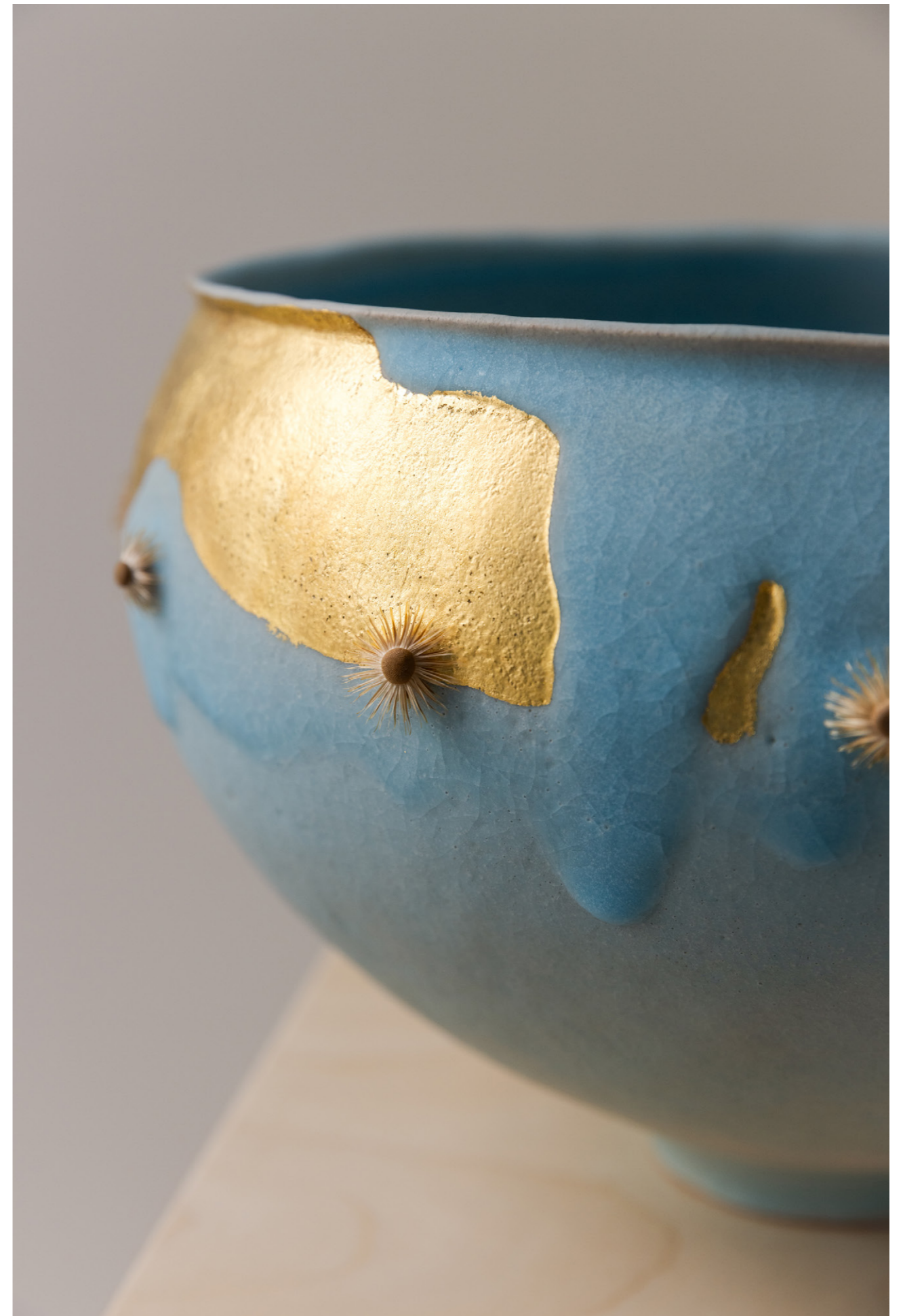
Immortelle Stoneware, glaze, porcelain, dry flowers, gold 33x21,5cm