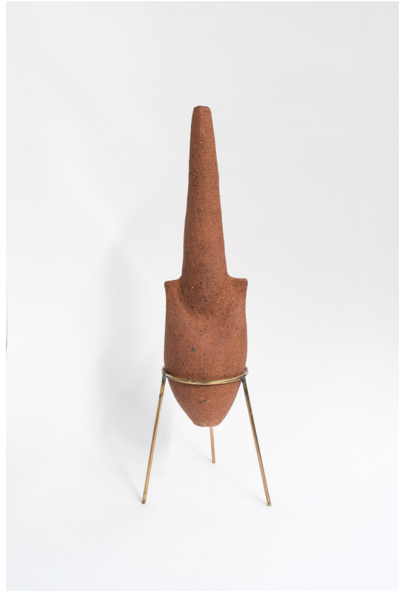
Bare stoneware sculpture, brass 37x15cm