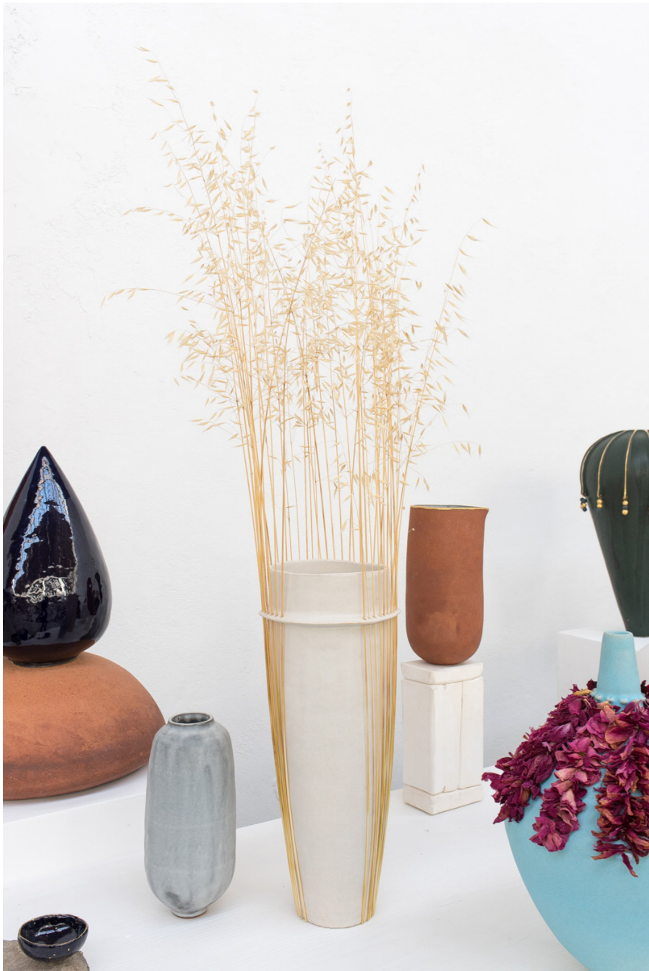
Stoneware vase, white glazed, gold, dry grasses from la Drôme - 64x26cm