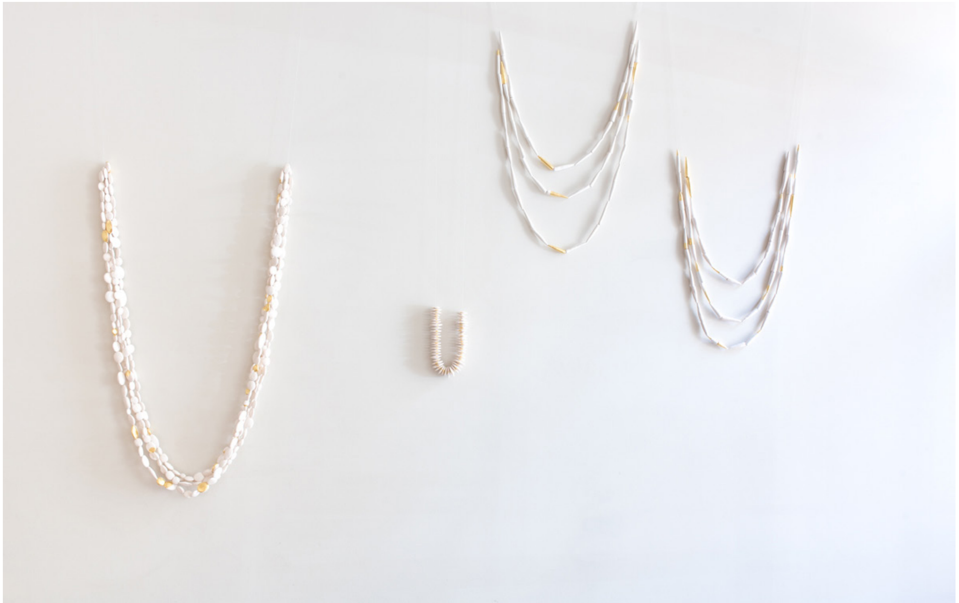
Erotes to kalokairi, Exhibition views at the French Institute, Athens, Greece - 2019 Earthenware, gold