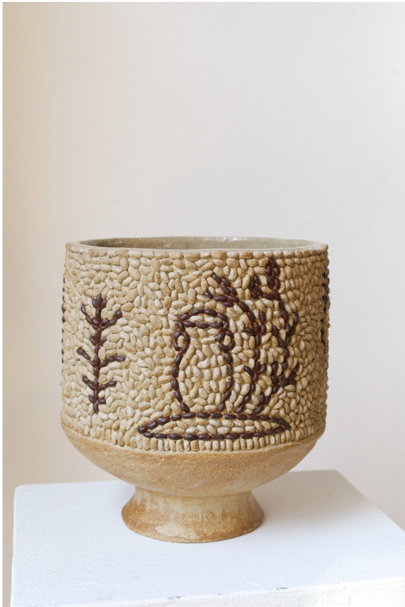
Χαλίκι III (The way we walk on it) Stoneware 27x25 cm