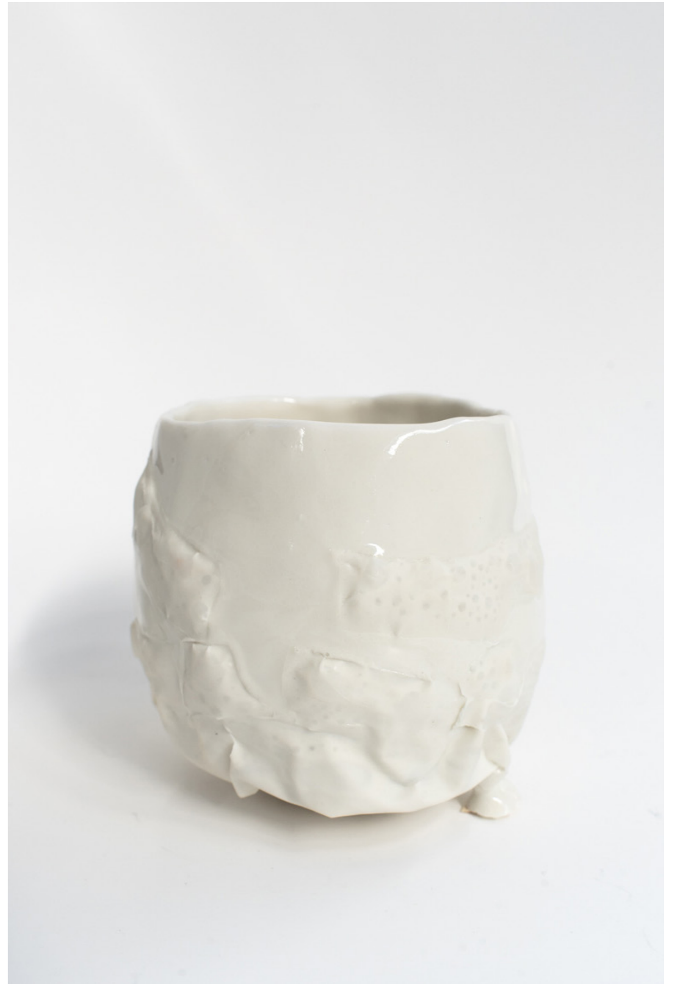
Porcelain bowl, earthenware, porcelain 10x14cm