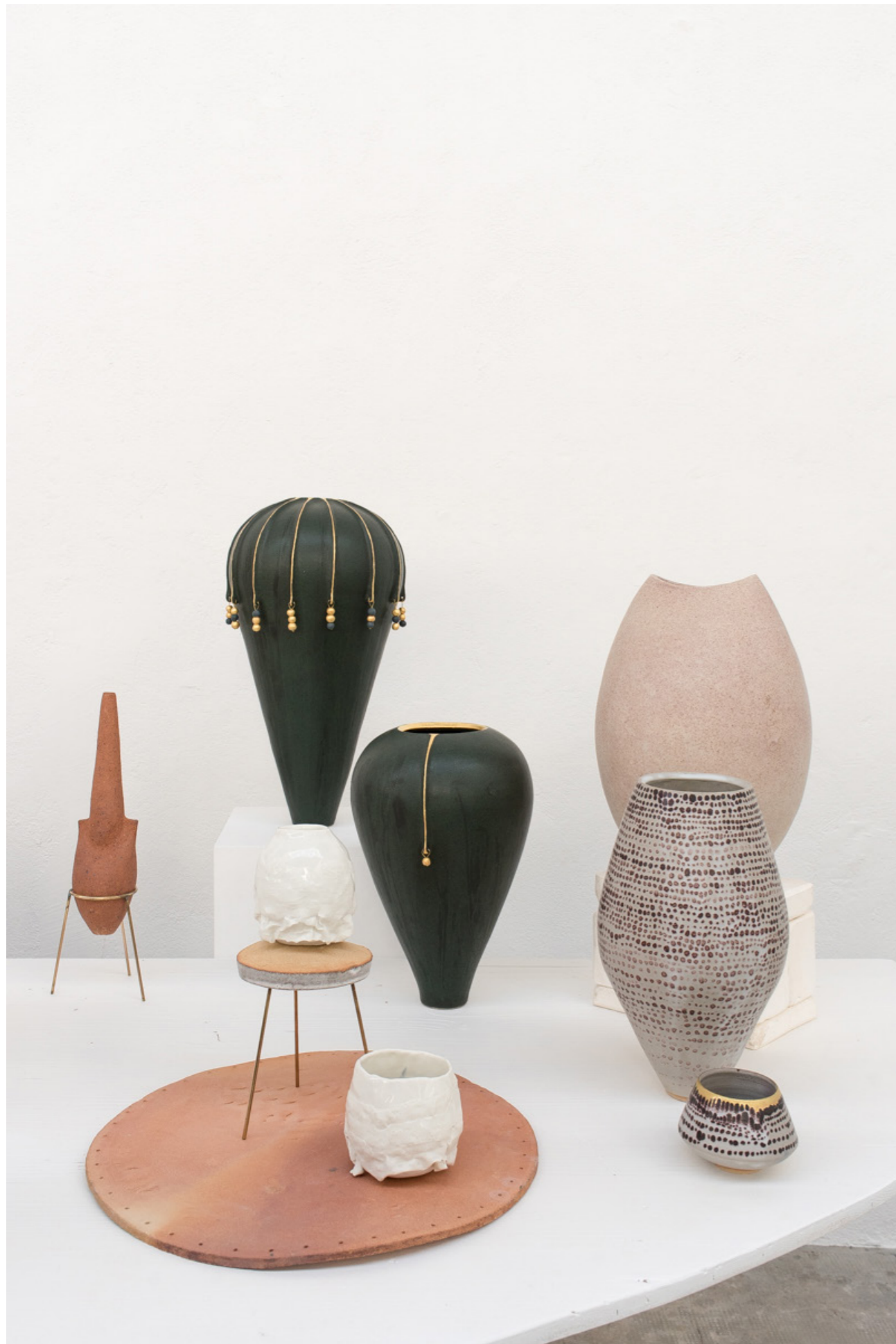
Stoneware vases and bowl, glazed clay and bare clay, brass, plaster