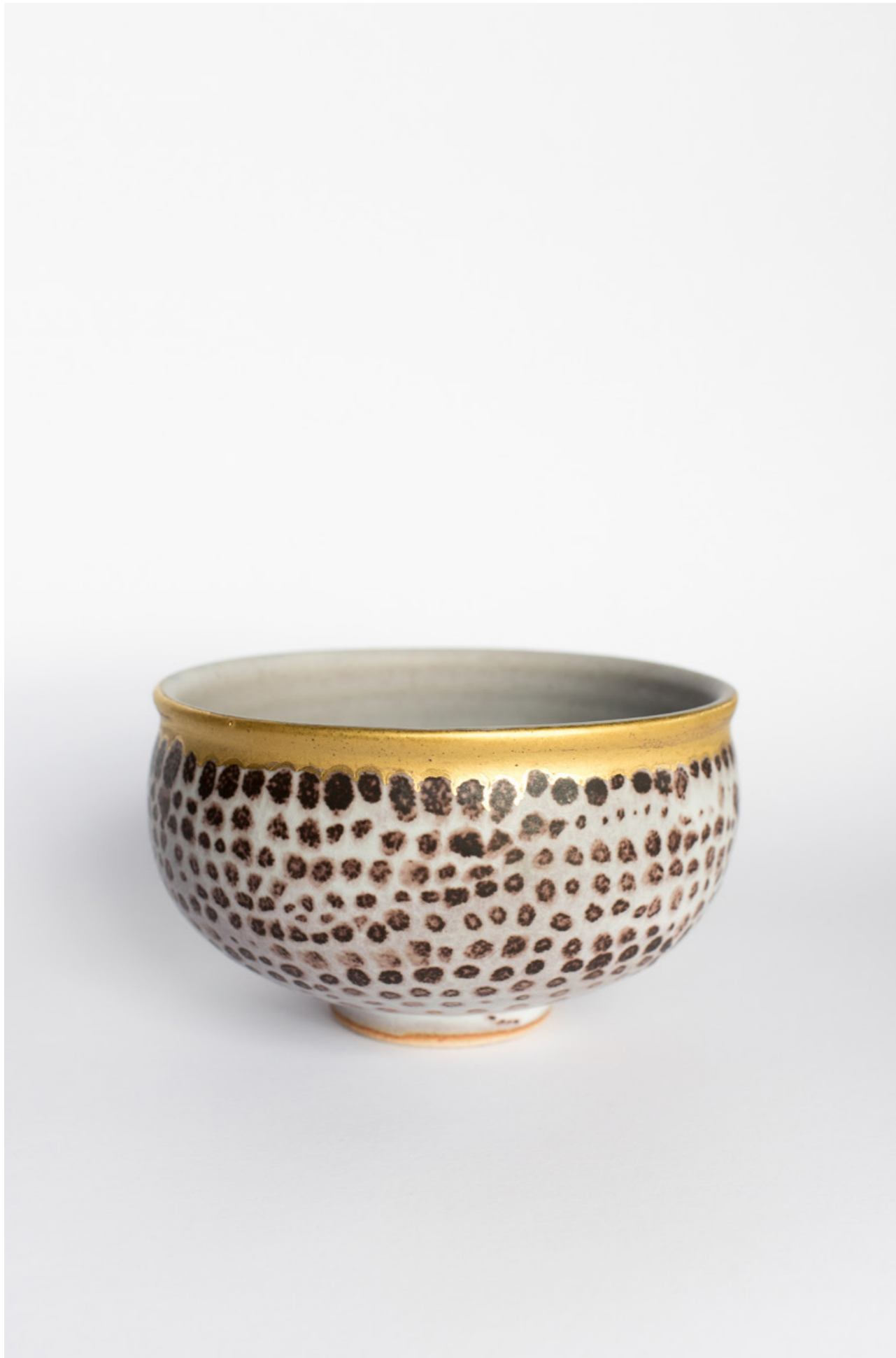
Stoneware bowl, glaze, gold 9x14cm