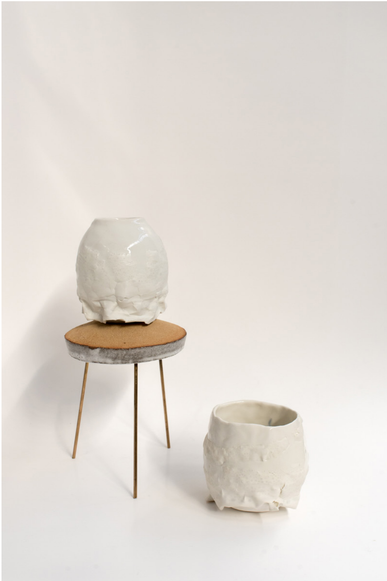
Porcelain bowl, earthenware, porcelain, brass 10x14cm each