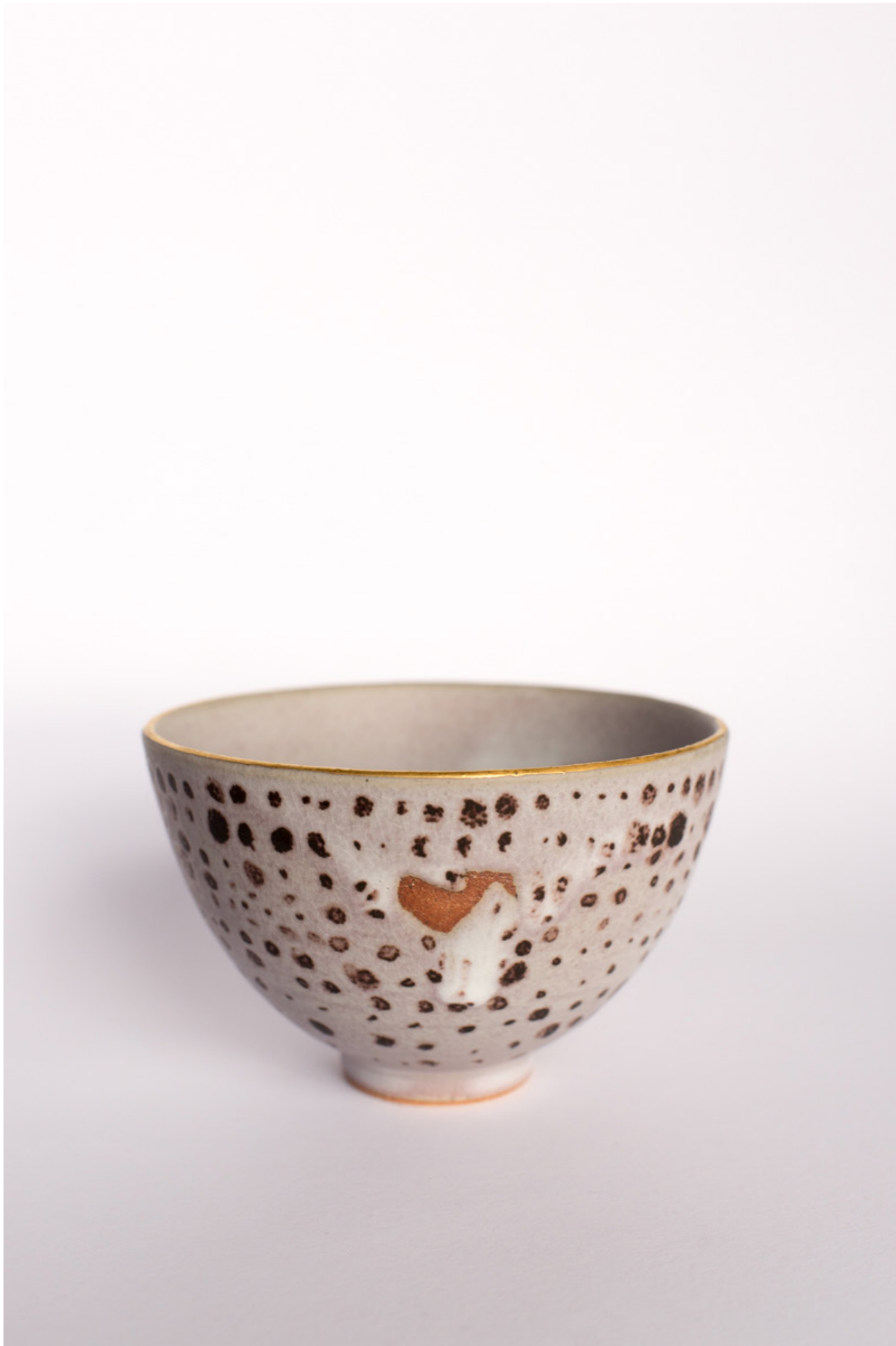
Stoneware bowl, glaze, gold 7x11cm