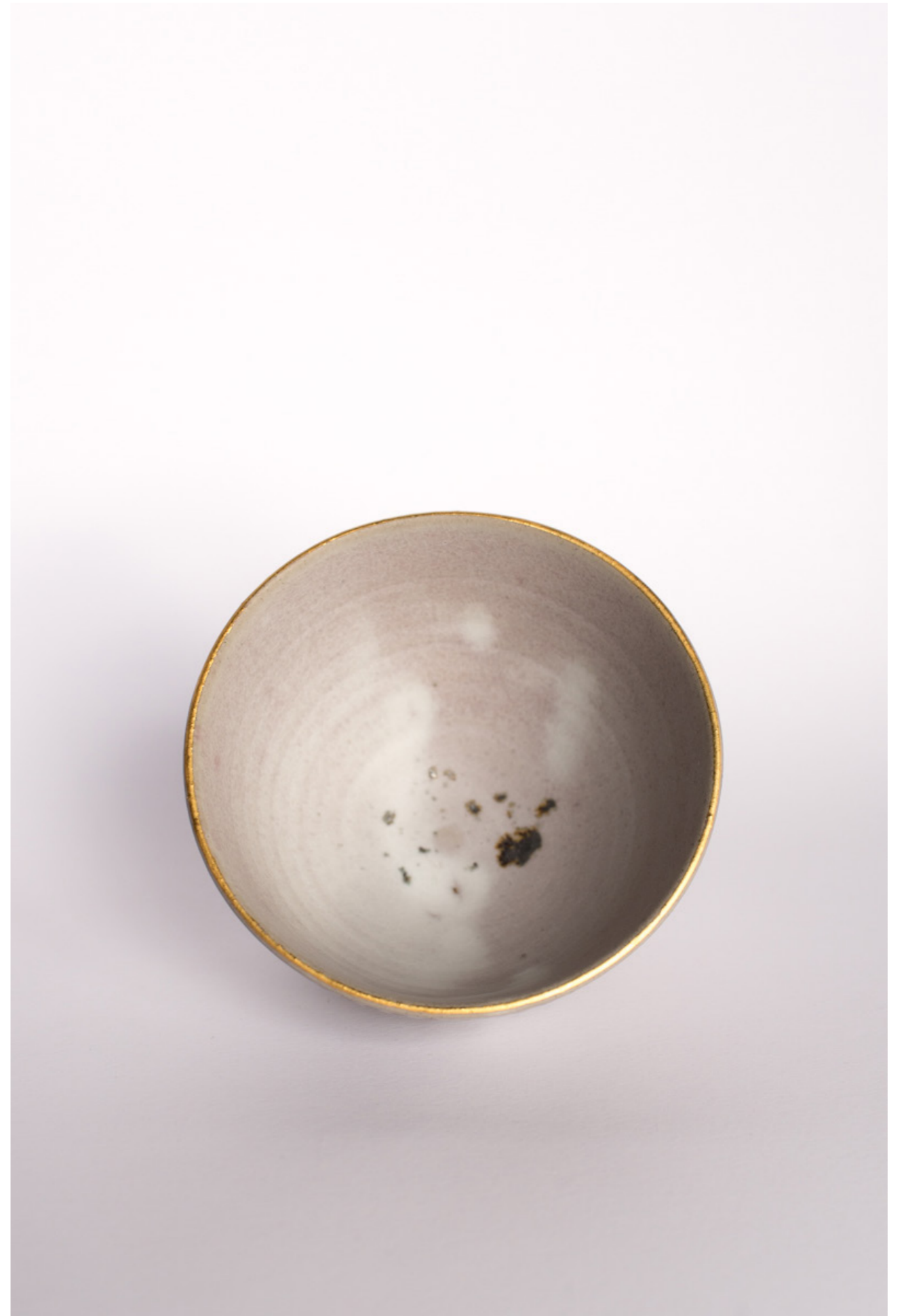
Stoneware bowl détail, glaze, gold 7x11cm