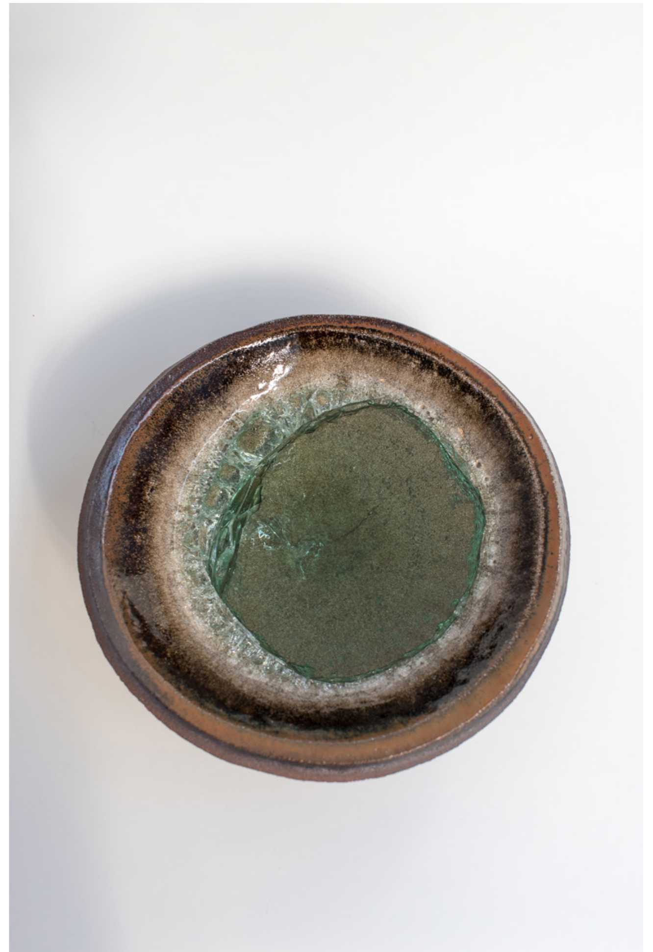
Stoneware plate, glass from the sea 23cm diameter