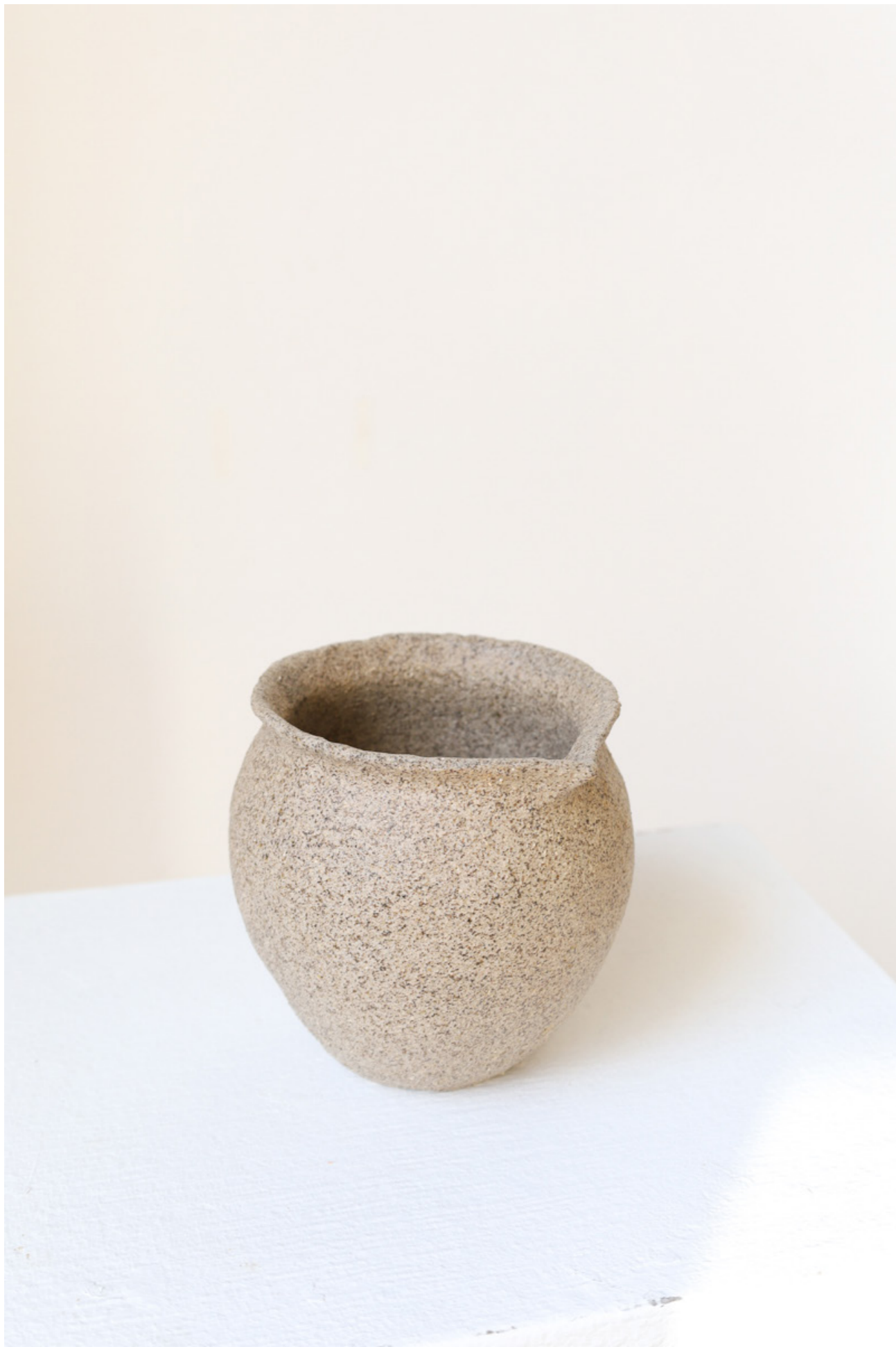
Small vase Stoneware, ashes glaze 13x14 cm