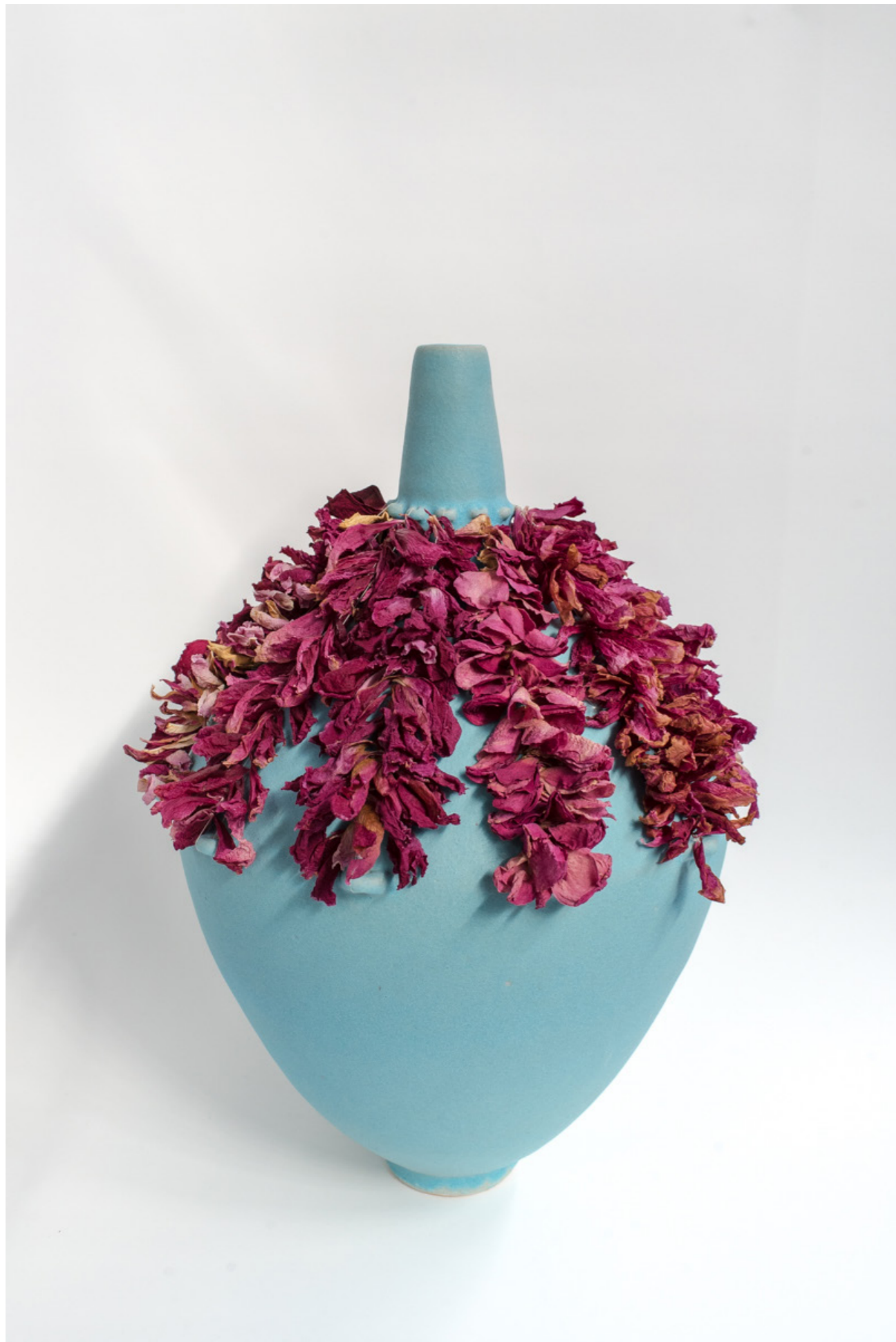
Stoneware vase, glaze, petals 45x30cm