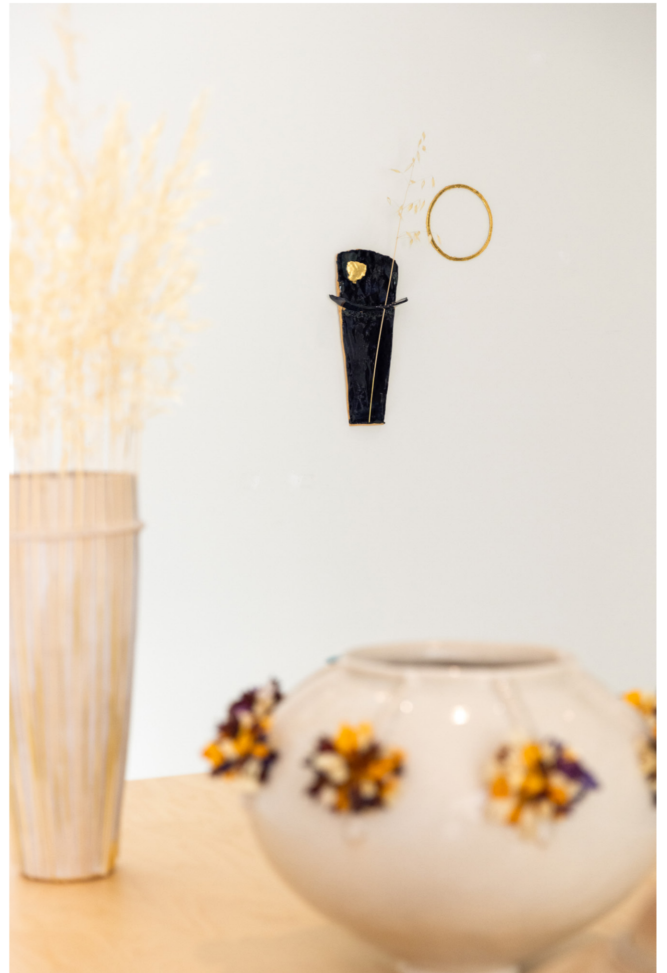
Offrande à la Lune Stoneware, glaze, grass, gold 42x22cm