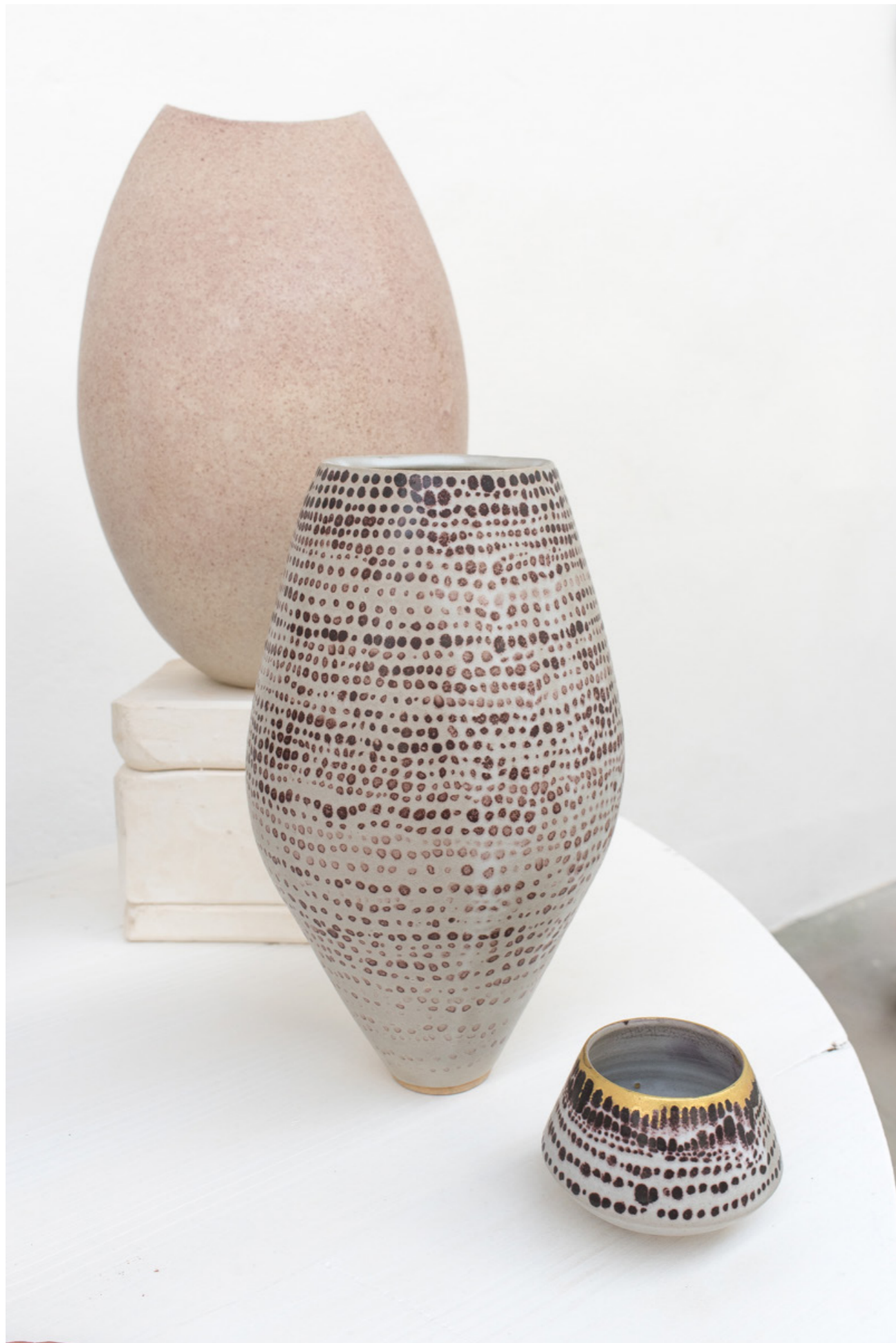
Stoneware vases and bowl, glaze, gold, plaster mold - 46x20cm