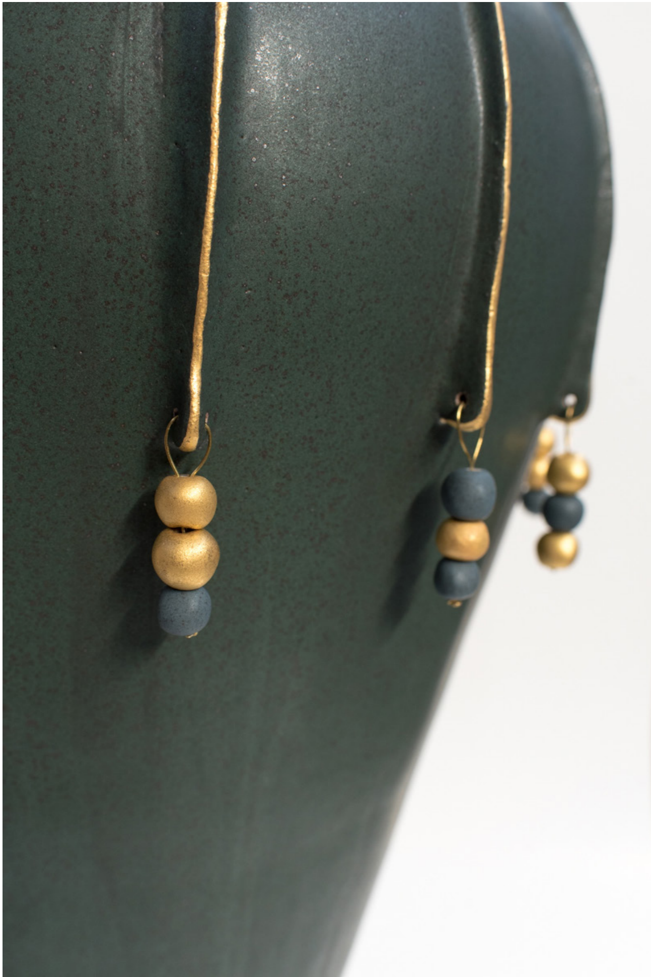
Stoneware vase details, glaze, gold, porcelain beads