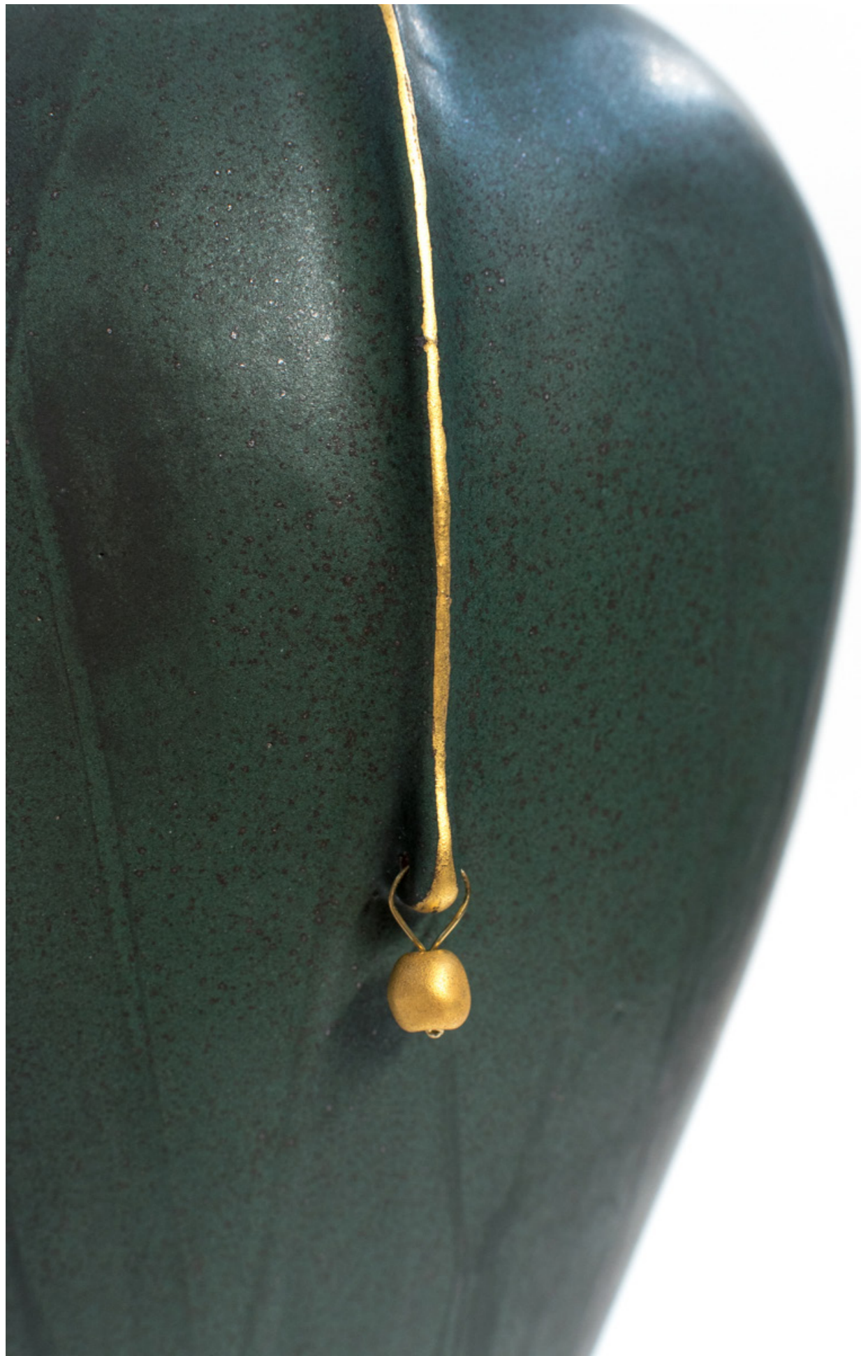
Stoneware vase detail, glaze, gold, porcelain beads