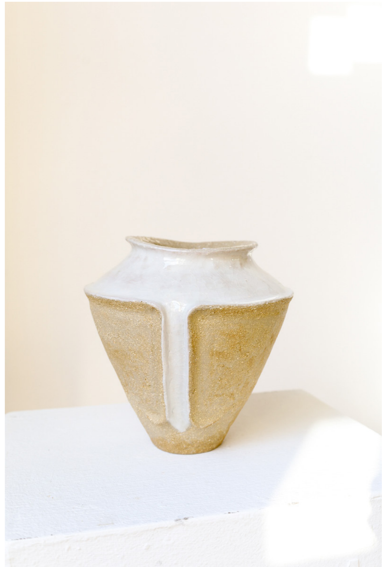
Vase d'eaux II Stoneware, porcelain 26x20 cm