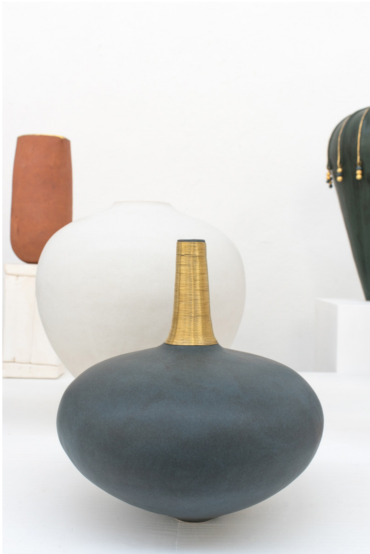
Stoneware vase, glaze, brass 34x24cm