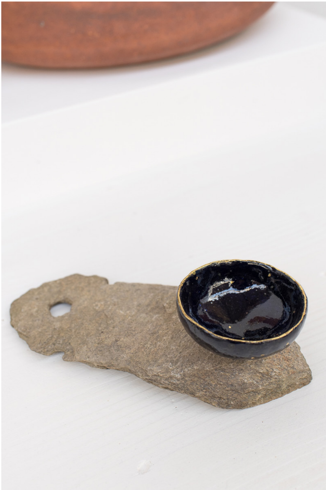
Bowl in harvest stoneware, cobalt glazed, gold, Cantal schist tile - 7x4cm