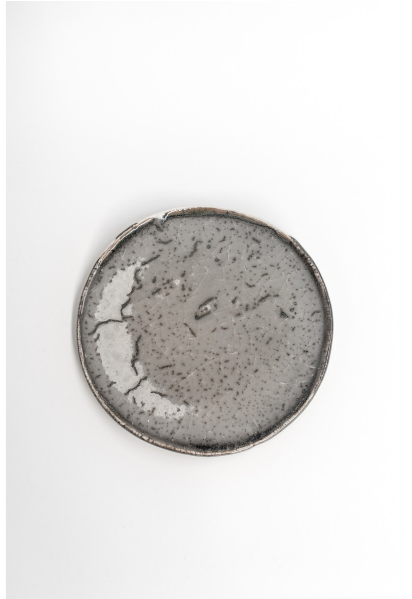
Stoneware plate, glazes 18cm diameter