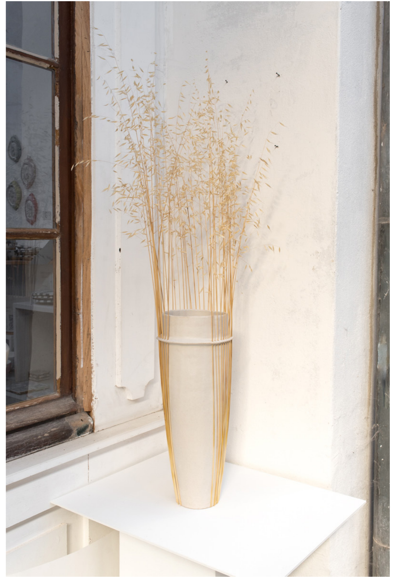
Stoneware vase, glaze, grass 60x25cm