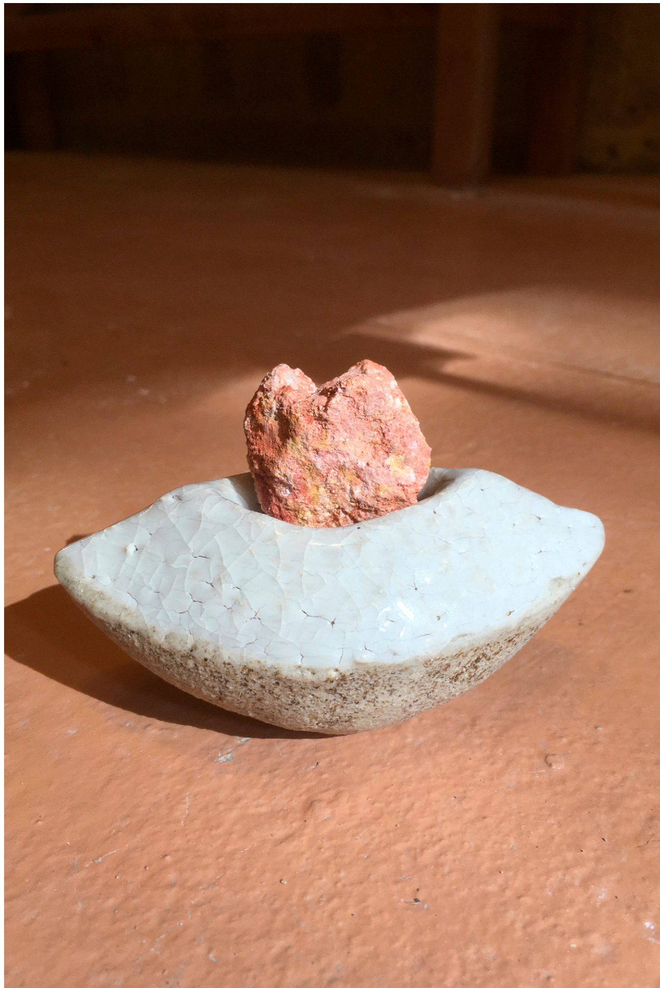
Grigri Stoneware, porcelain, glaze, wild clay, ashes, volcanic rocks 19 x14 cm