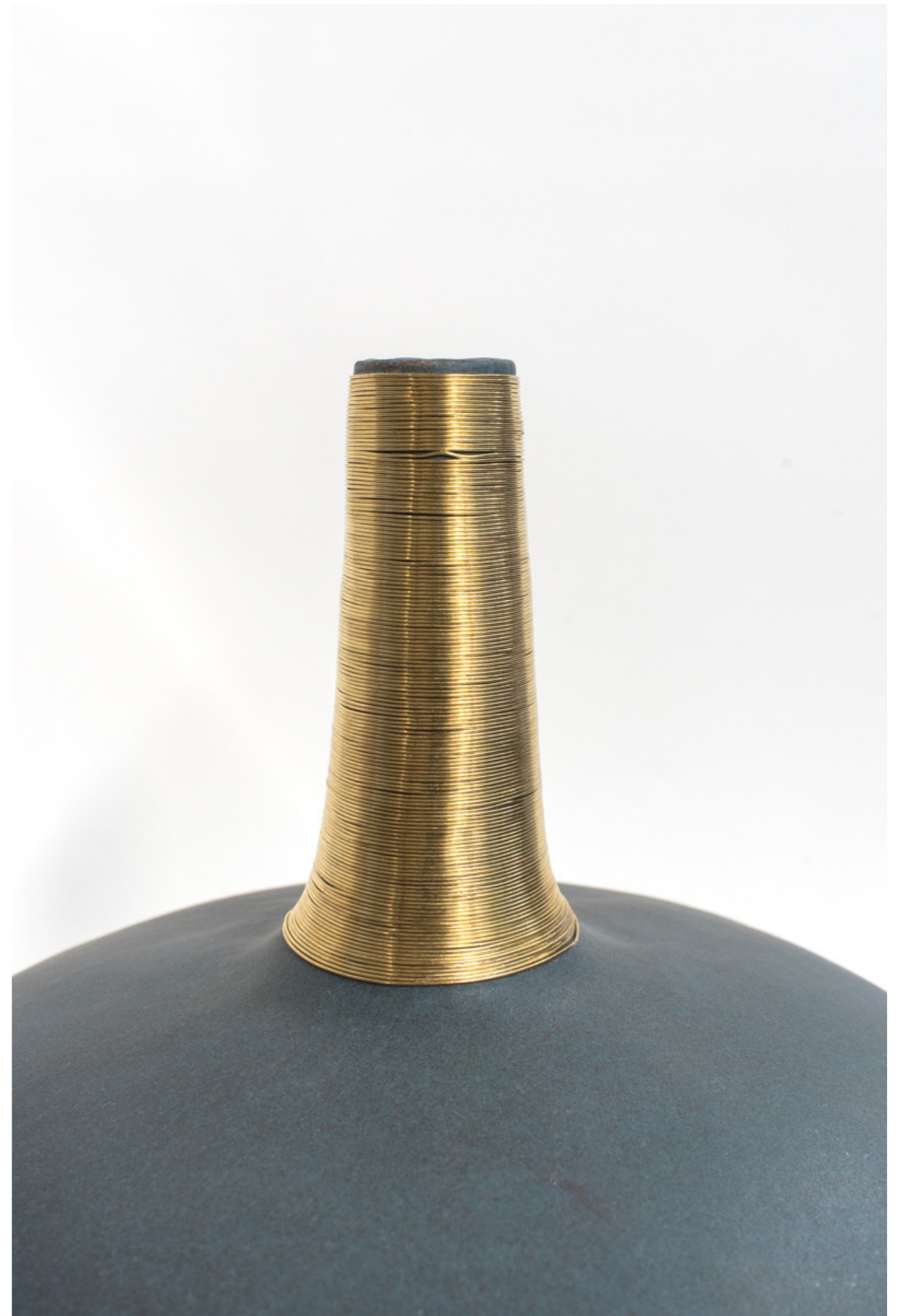
Stoneware vase detail, glaze, gold, brass