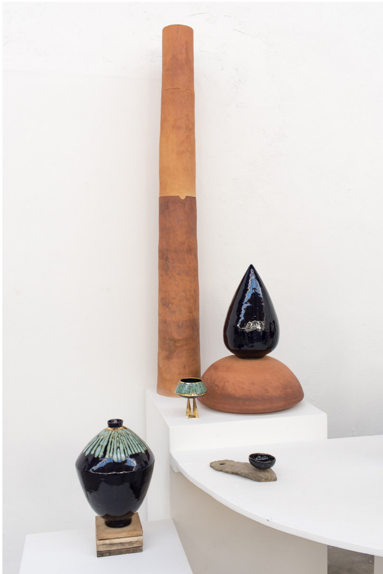
Stoneware vases and cups, glazed clay and bare clay, tiles