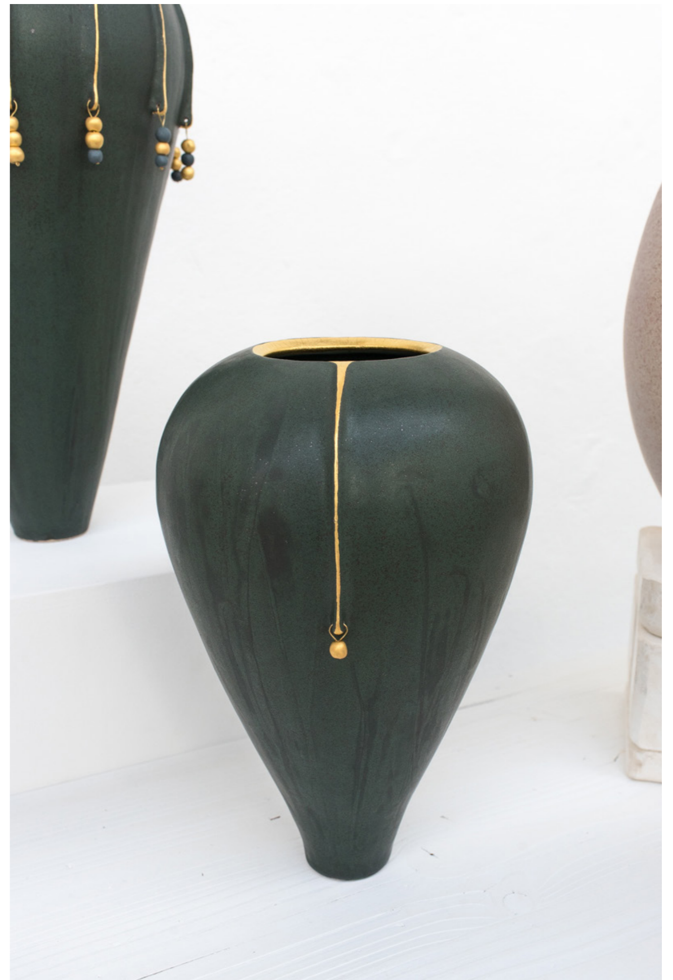
Stoneware vase, glaze, gold, porcelain beads 41x20cm