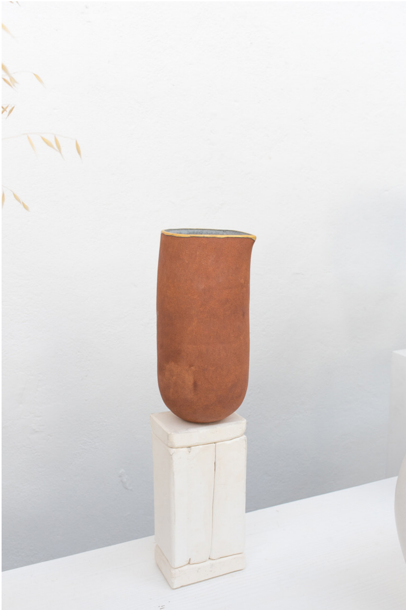
Bare stoneware vase, glazed inside, gold, plaster mold - 32x14cm