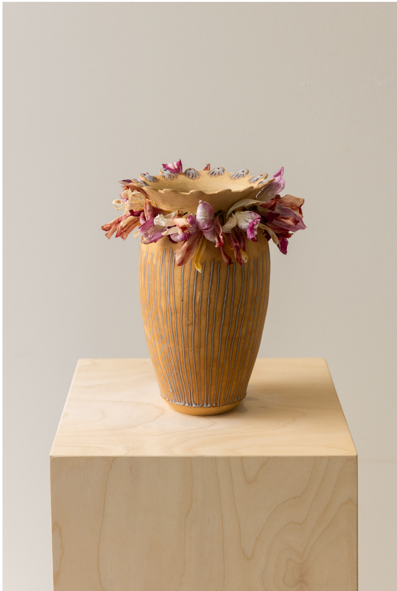
Alixi's Tulips Stoneware, glaze, petals 34x25cm