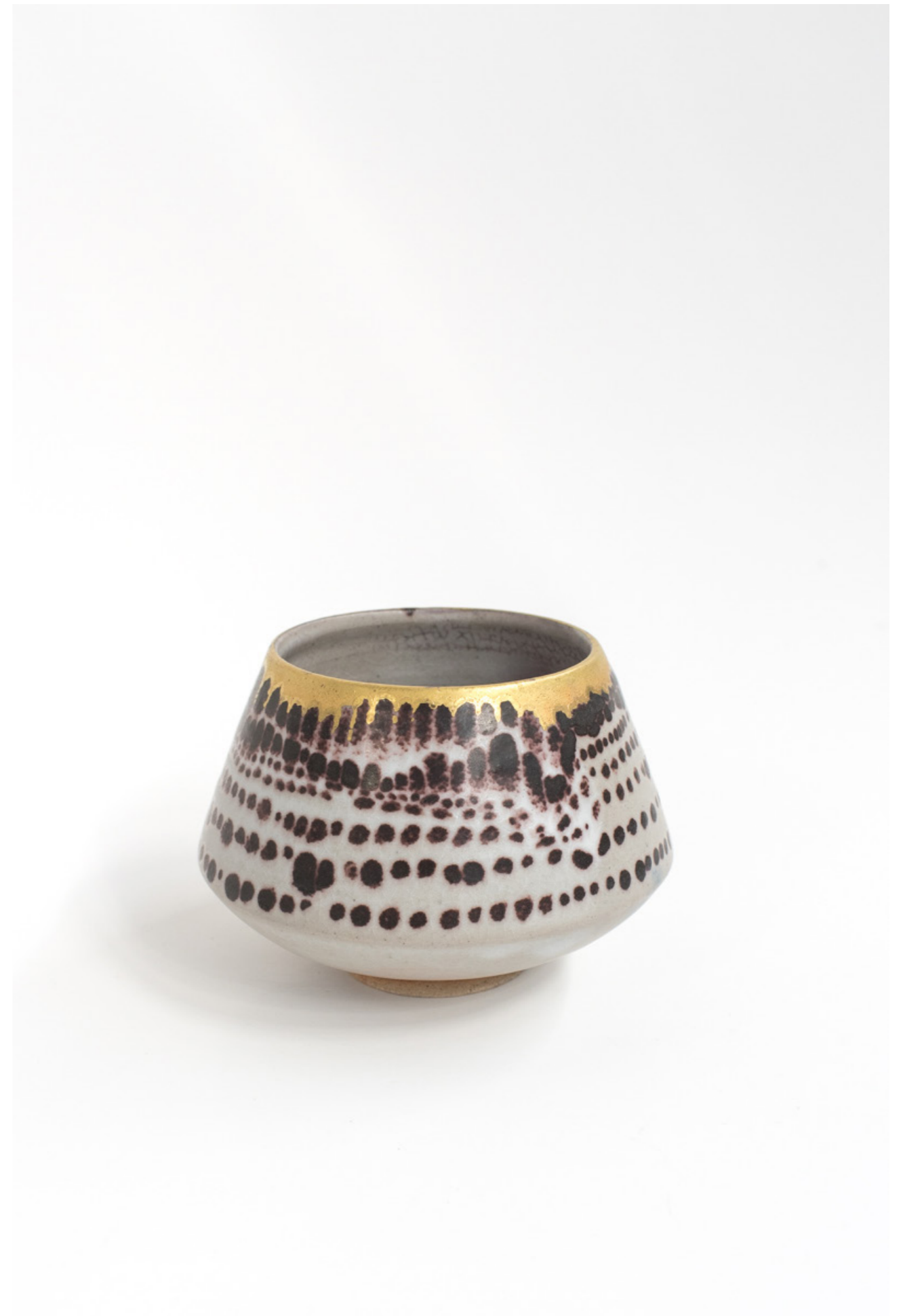
Stoneware bowl, glaze, gold 7x12cm