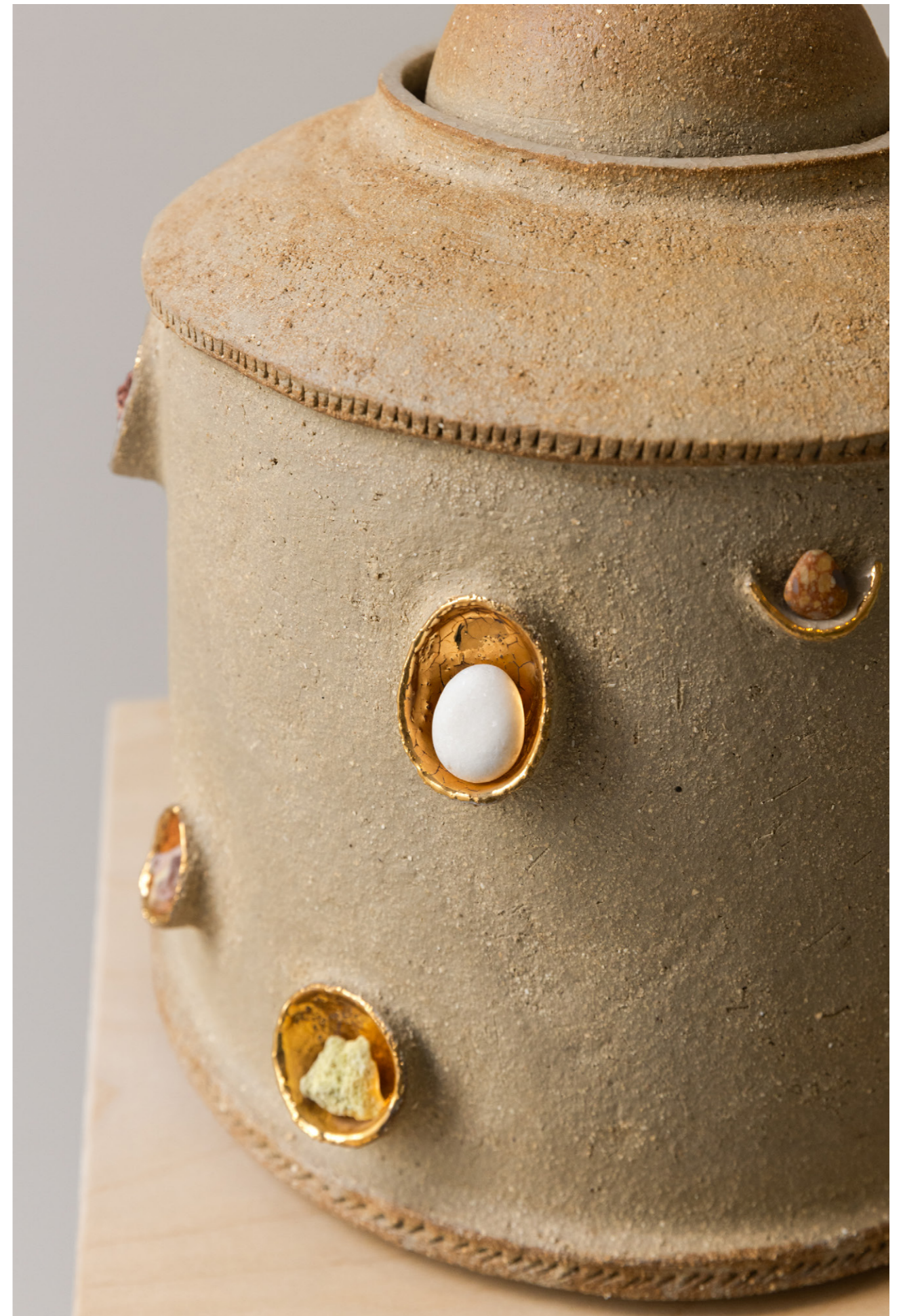
Boite aux trésors Stoneware, gold, volcano rocks, shells 27x25,5cm