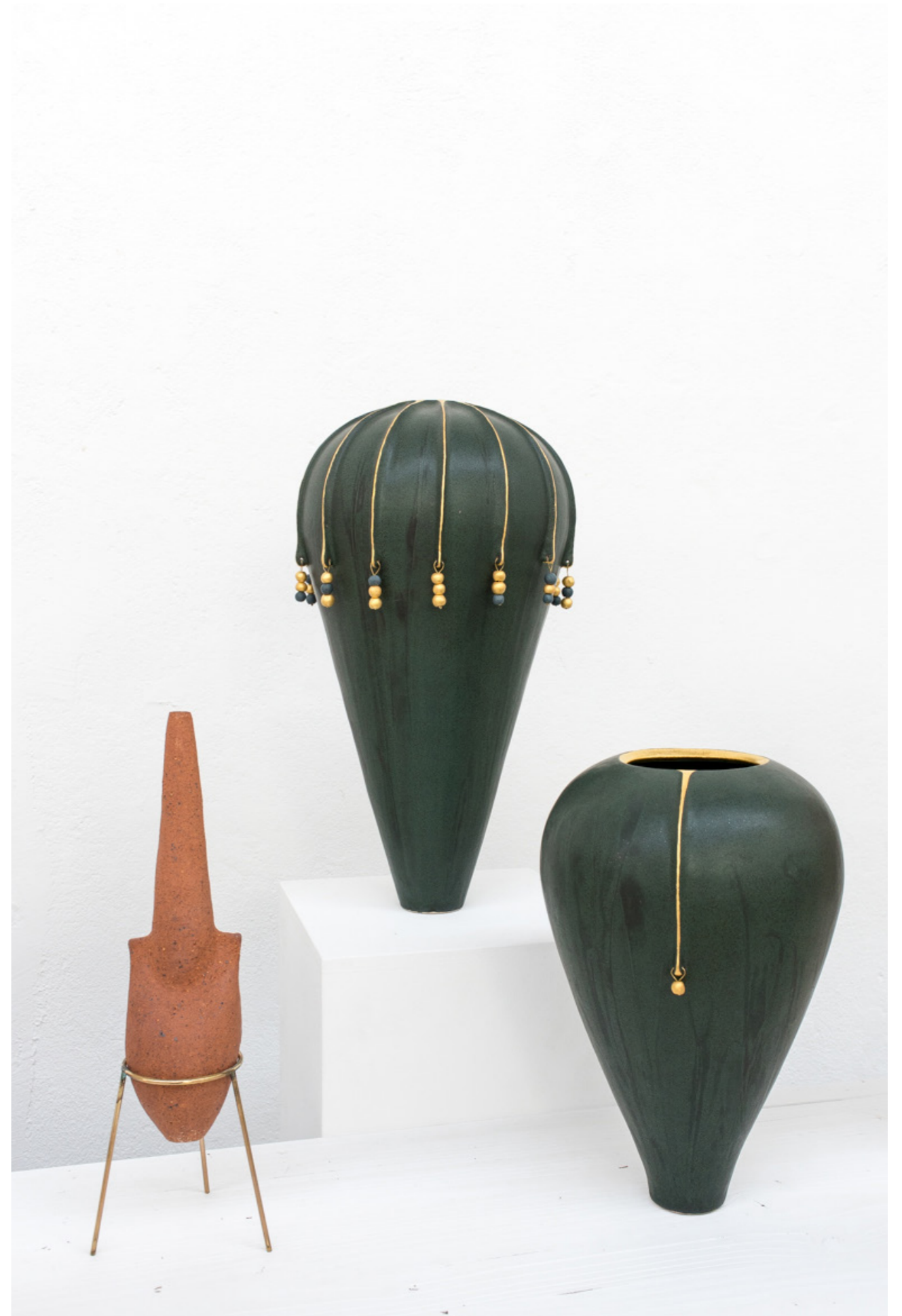
Stoneware vases, gold, brass - 54x30cm (for the biggest peice)