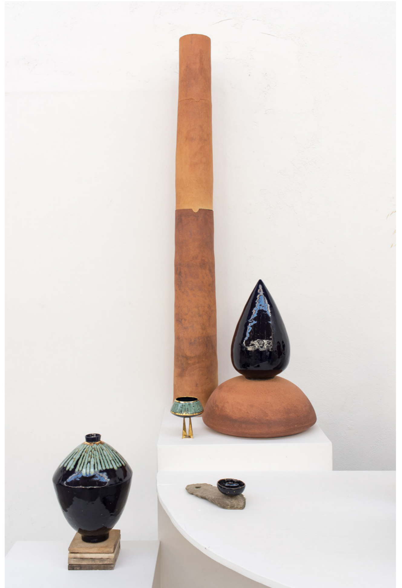
Stoneware, glaze, gold, tiles from an old factory 35cm x 35cm