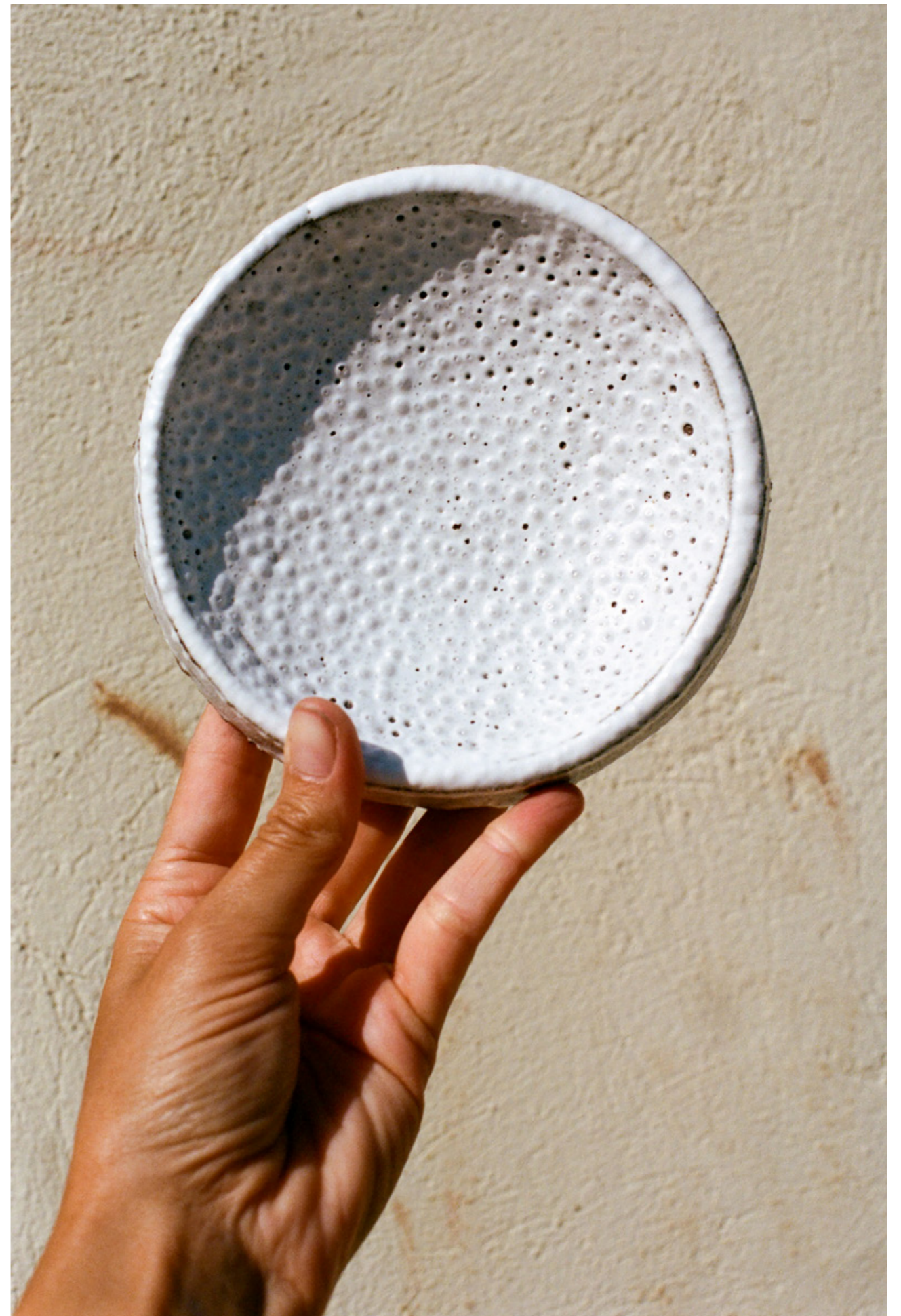
Stoneware plate, glaze 15cm diameter