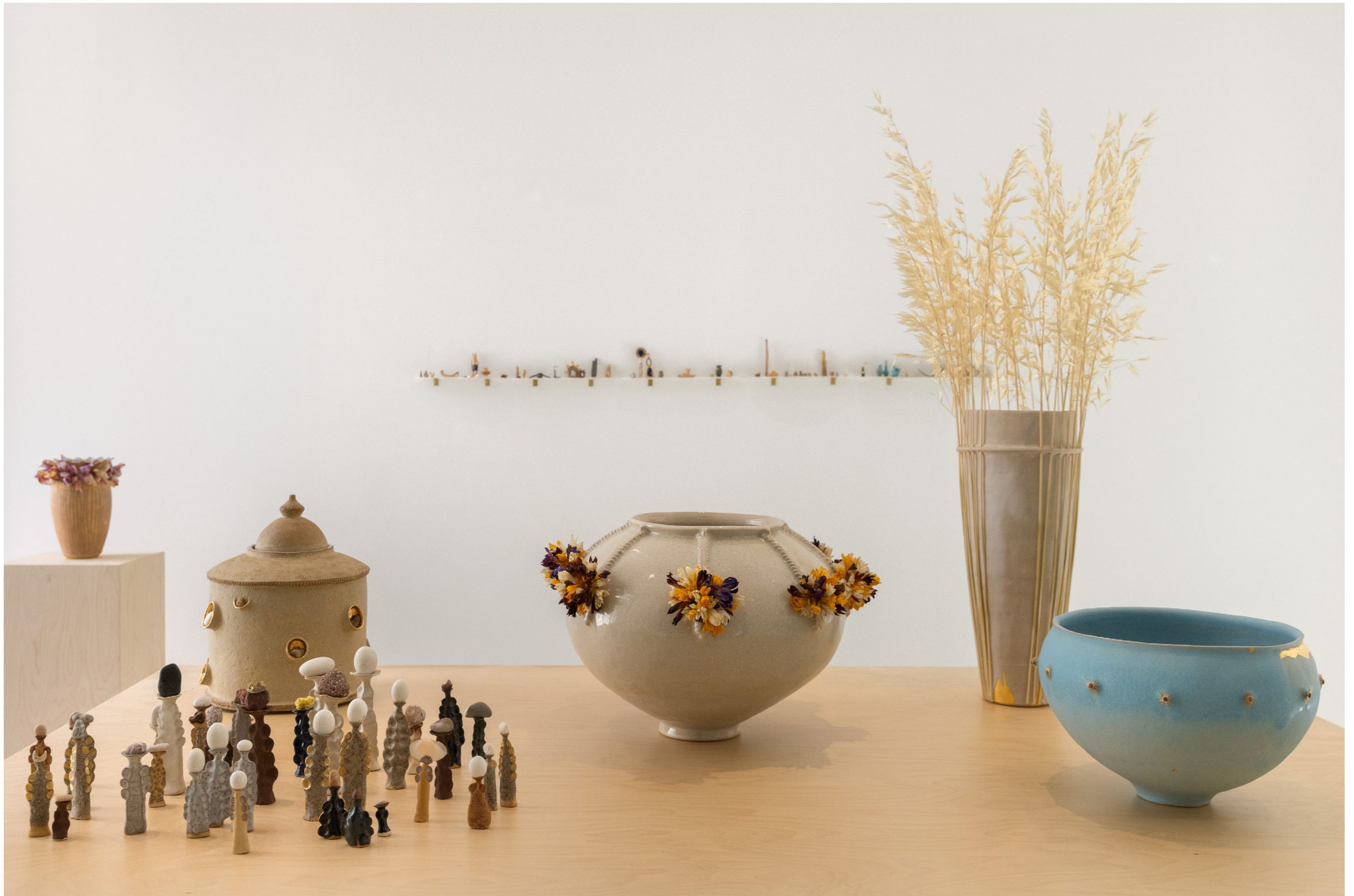
Installation view Wild Fields at Arch Athens, Greece - 2024 Bare stoneware, glazed stoneware, porcelain, petals, grasses, gold, rocks, shells