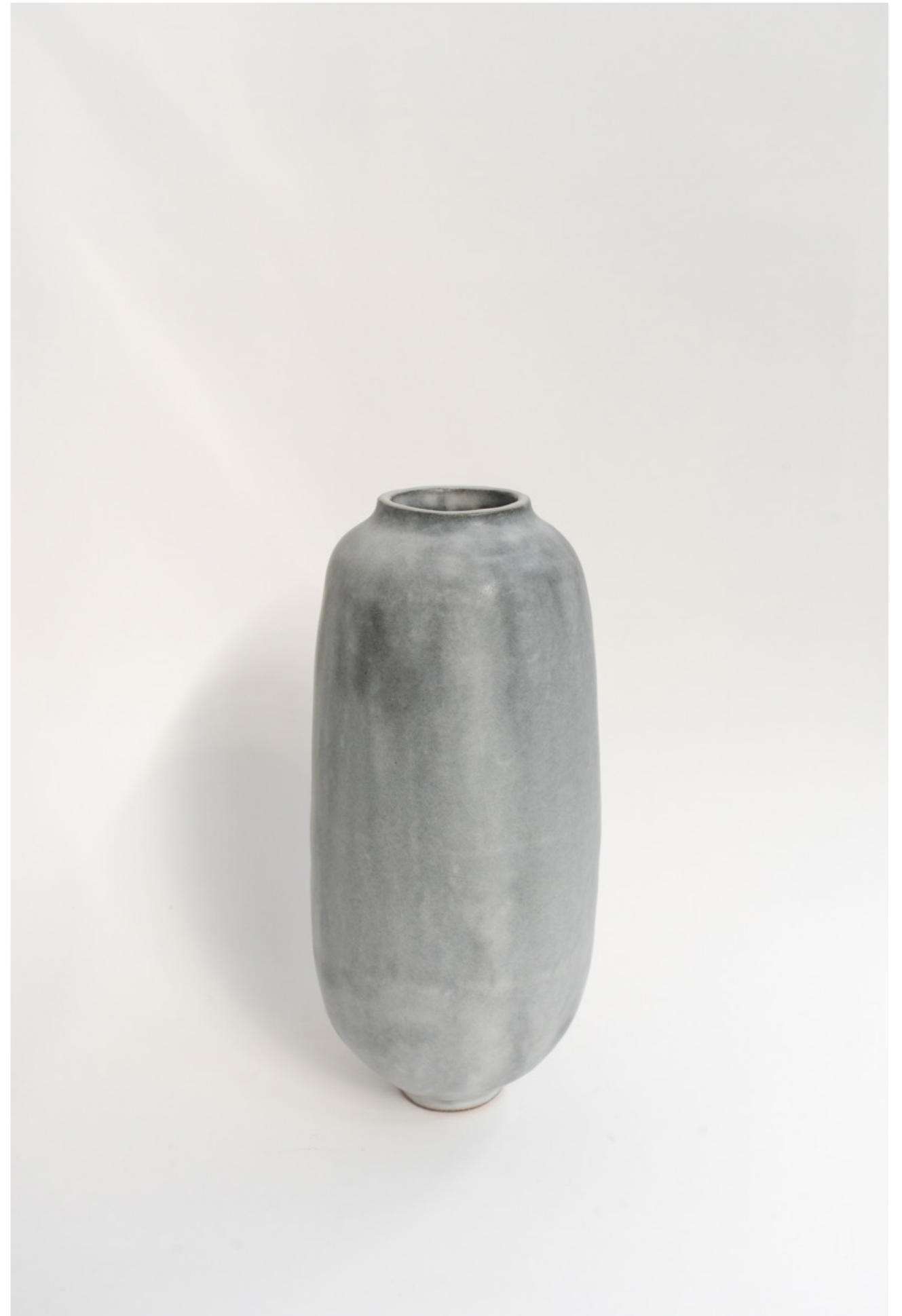
Stoneware vase, glaze 33x15cm