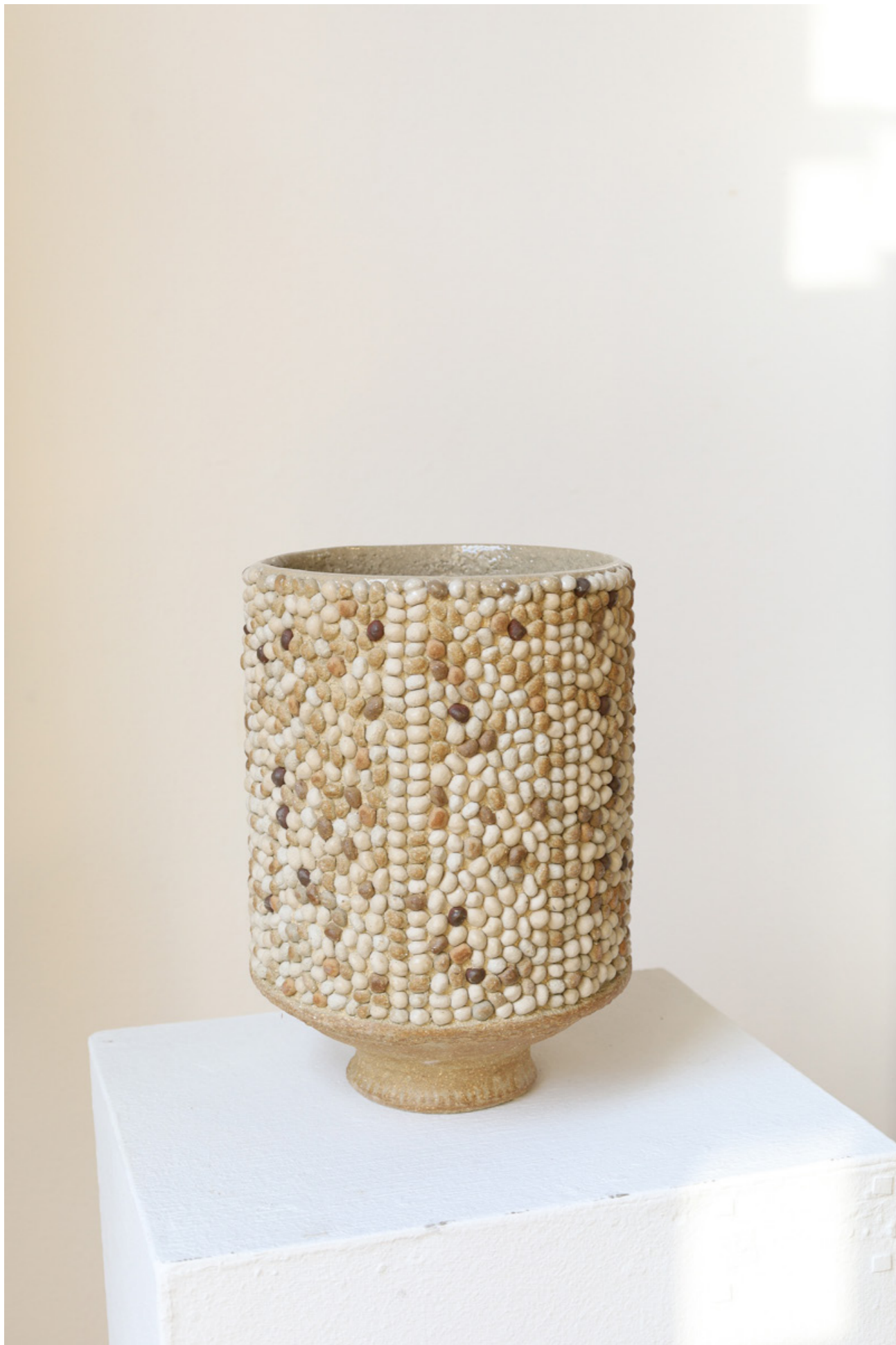
Χαλίκι II (The way we walk on it) Stoneware 40x25 cm