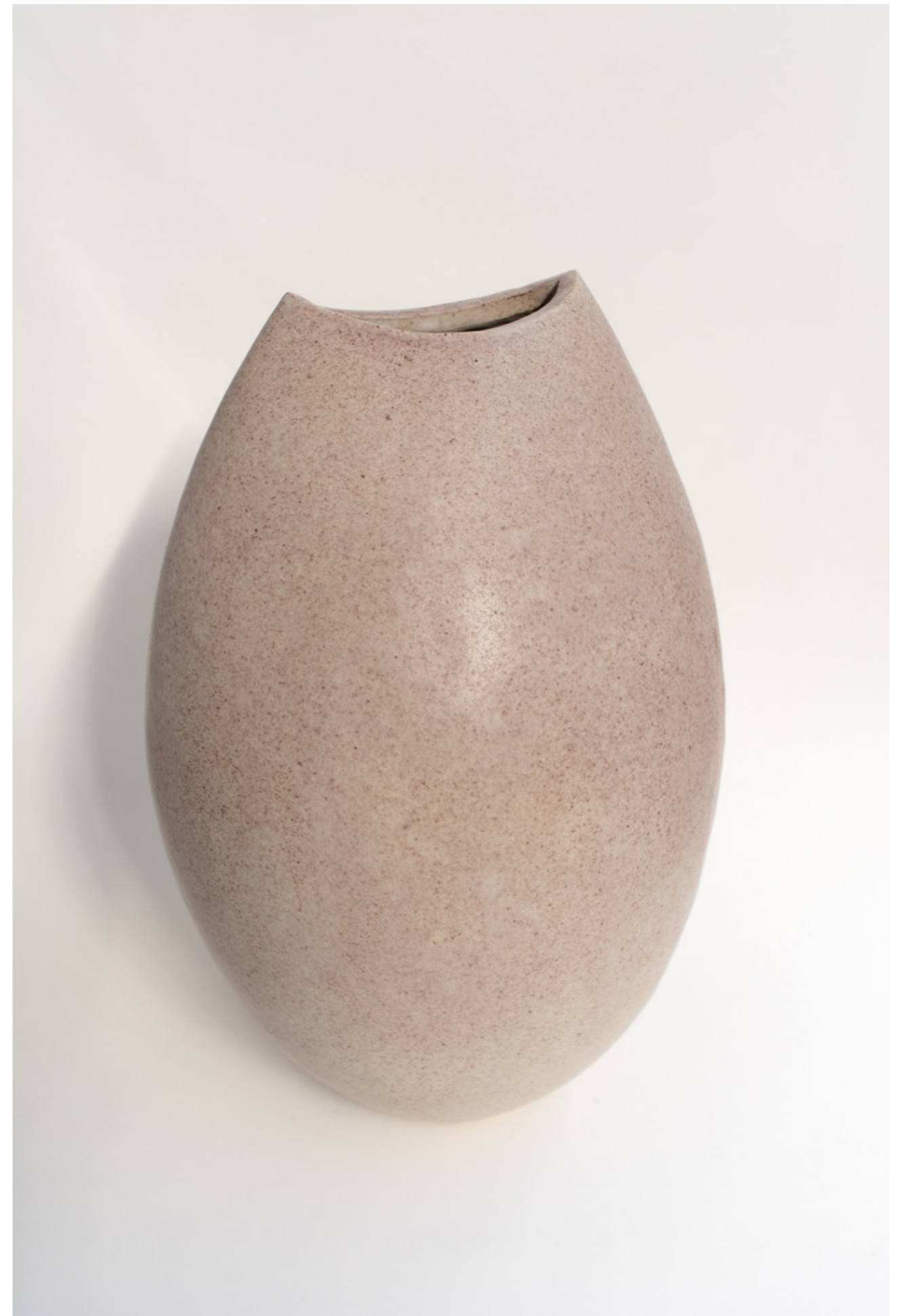
Stoneware vase, glaze 50x30cm