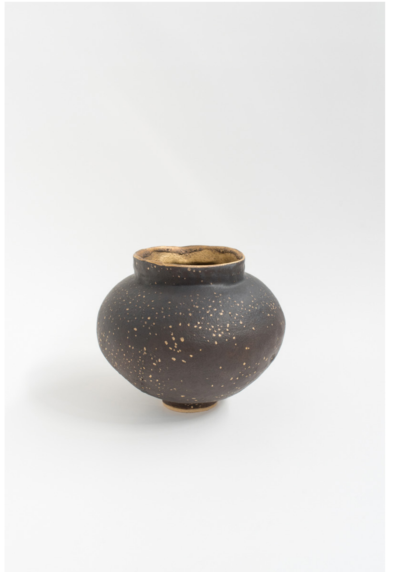
Stoneware vase, glaze, gold 15x19cm