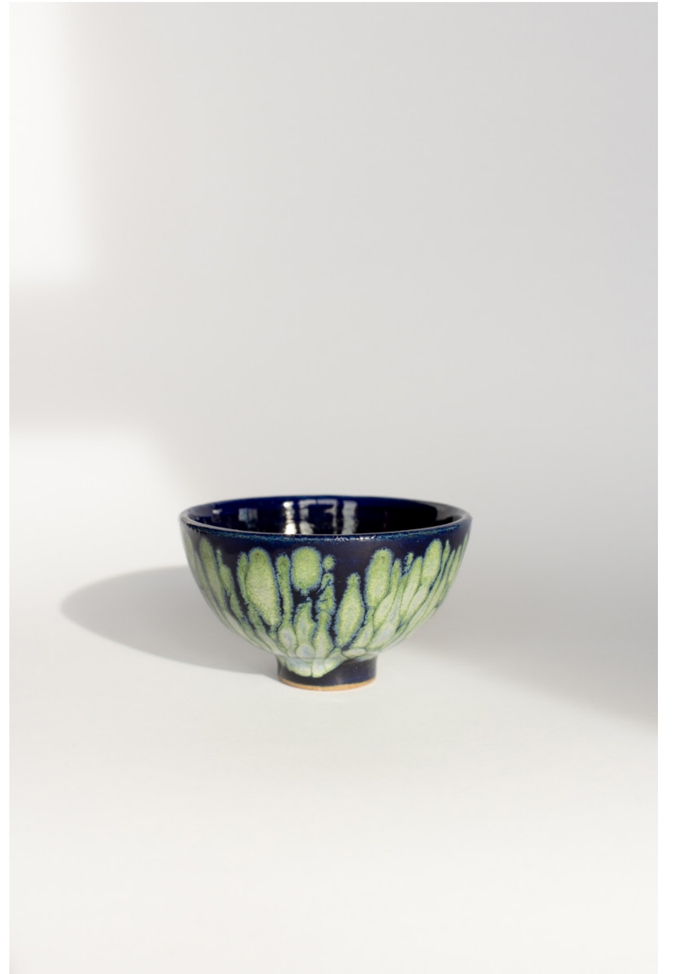
Stoneware bowl, glaze 5x8cm