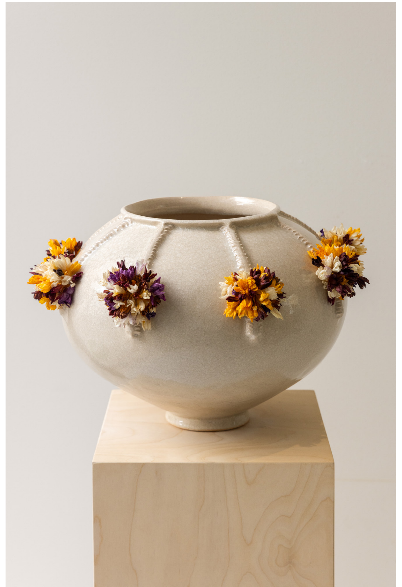
Wild Field Stoneware, glaze, dry petals 44x32cm