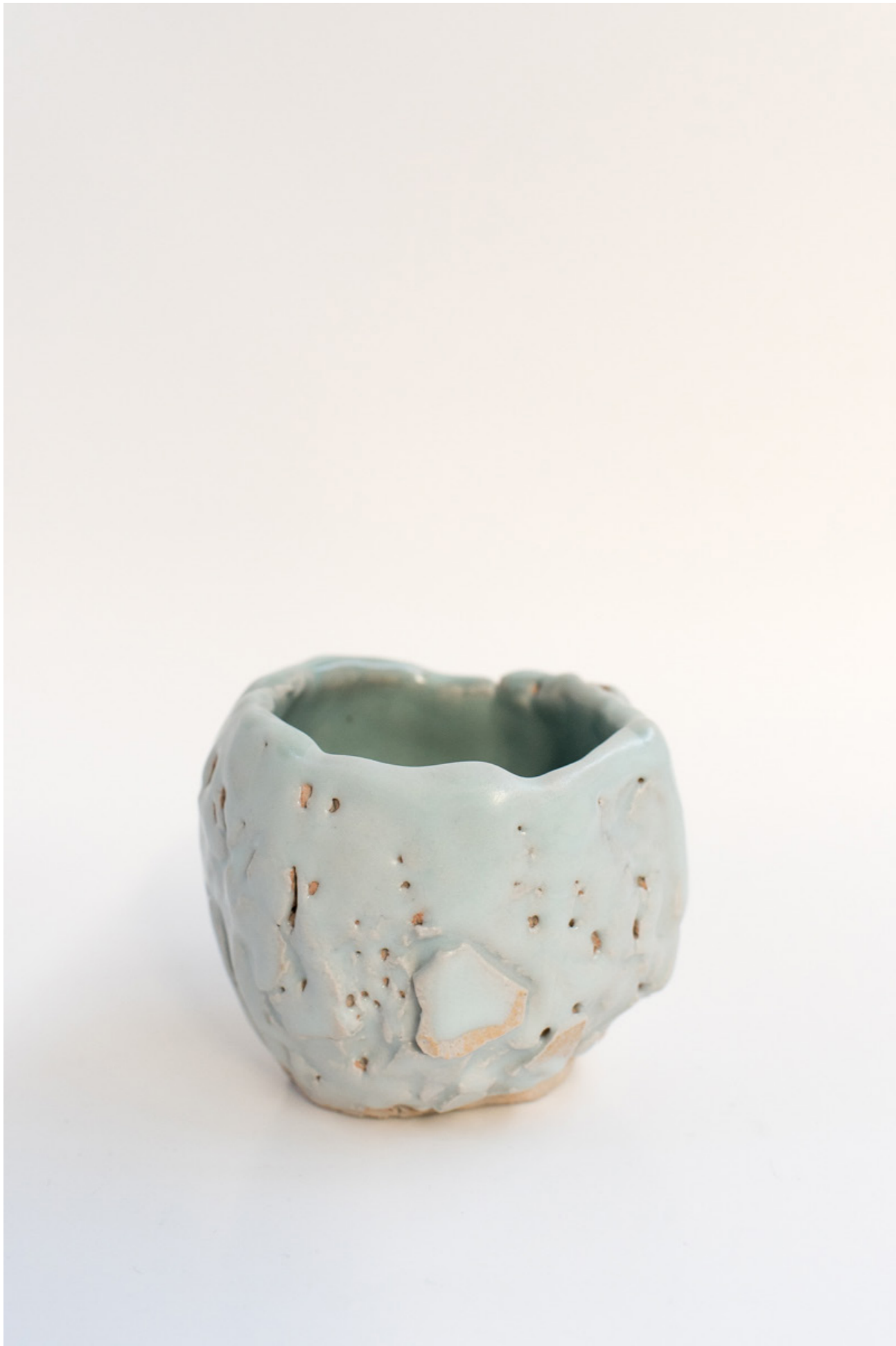
Bowl in harvest stoneware, glaze 10x20cm