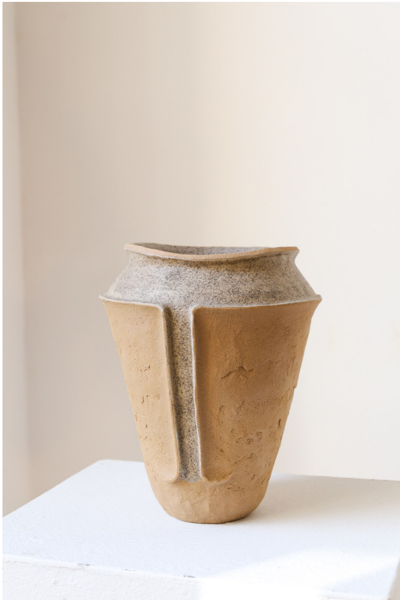
Vase d'eaux I Stoneware, ashes glaze 34x21 cm