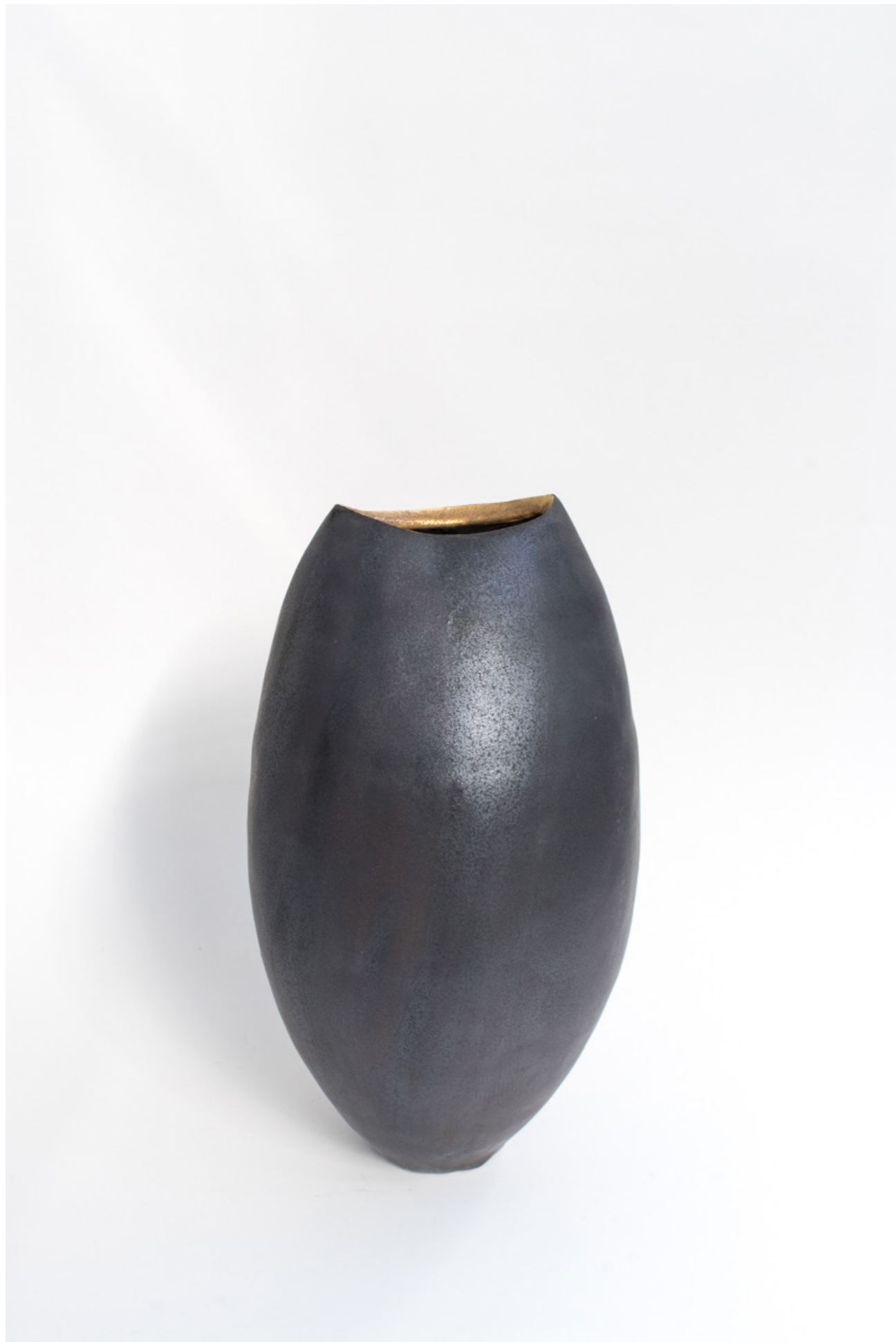
Stoneware vase, glaze, gold 33x16cm