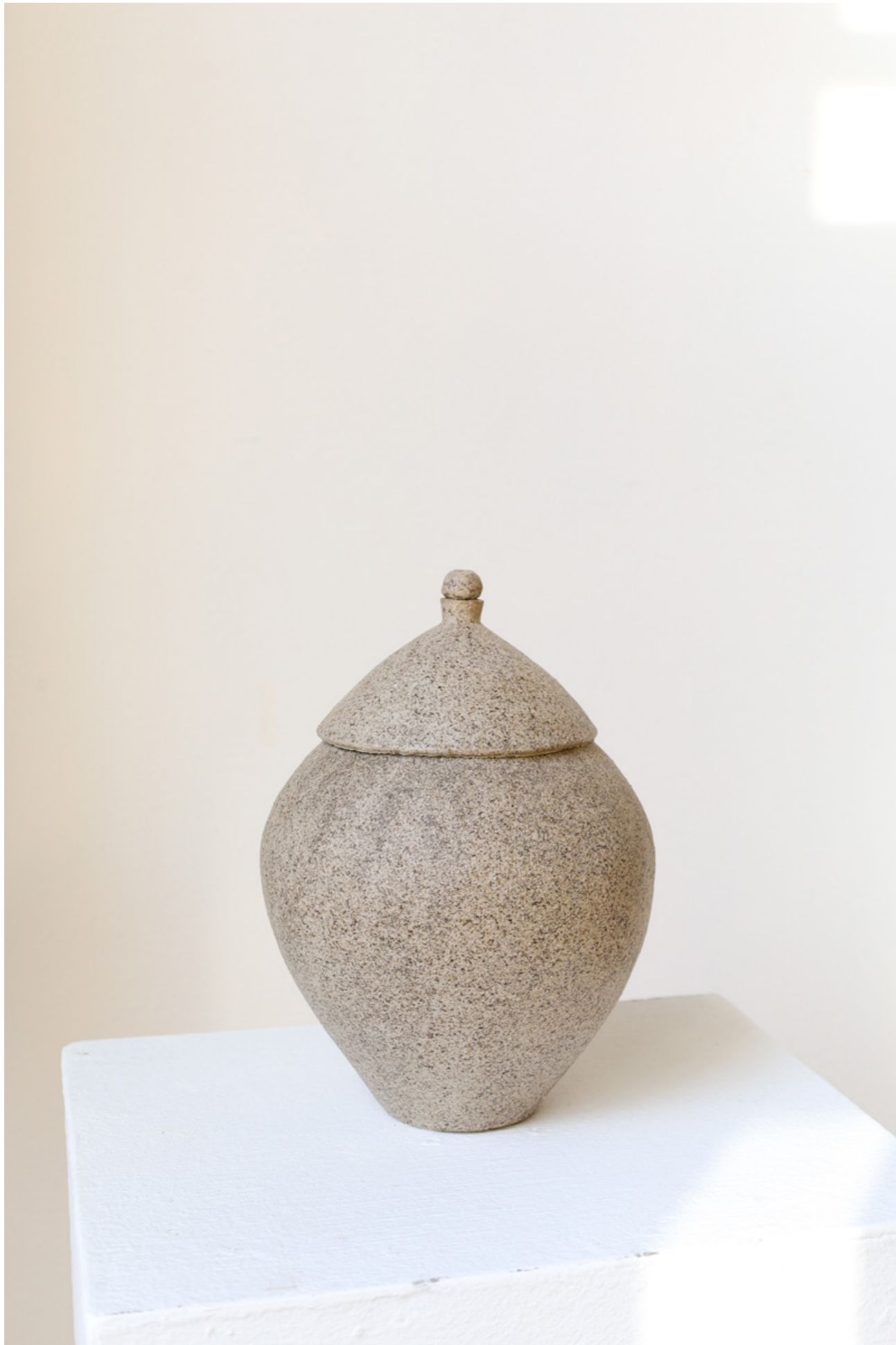
Boite Stoneware, ashes glaze 17x25 cm