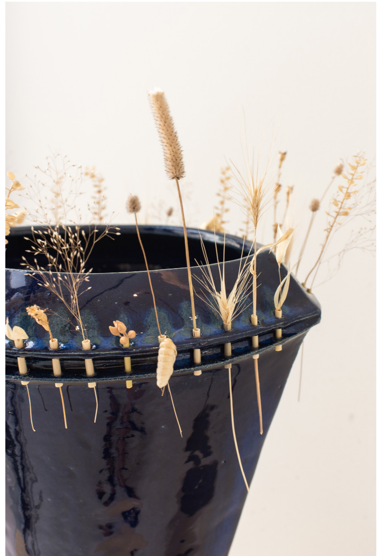
La Veillée Stoneware vase, glaze, porcelain, dry flowers 37x22cm