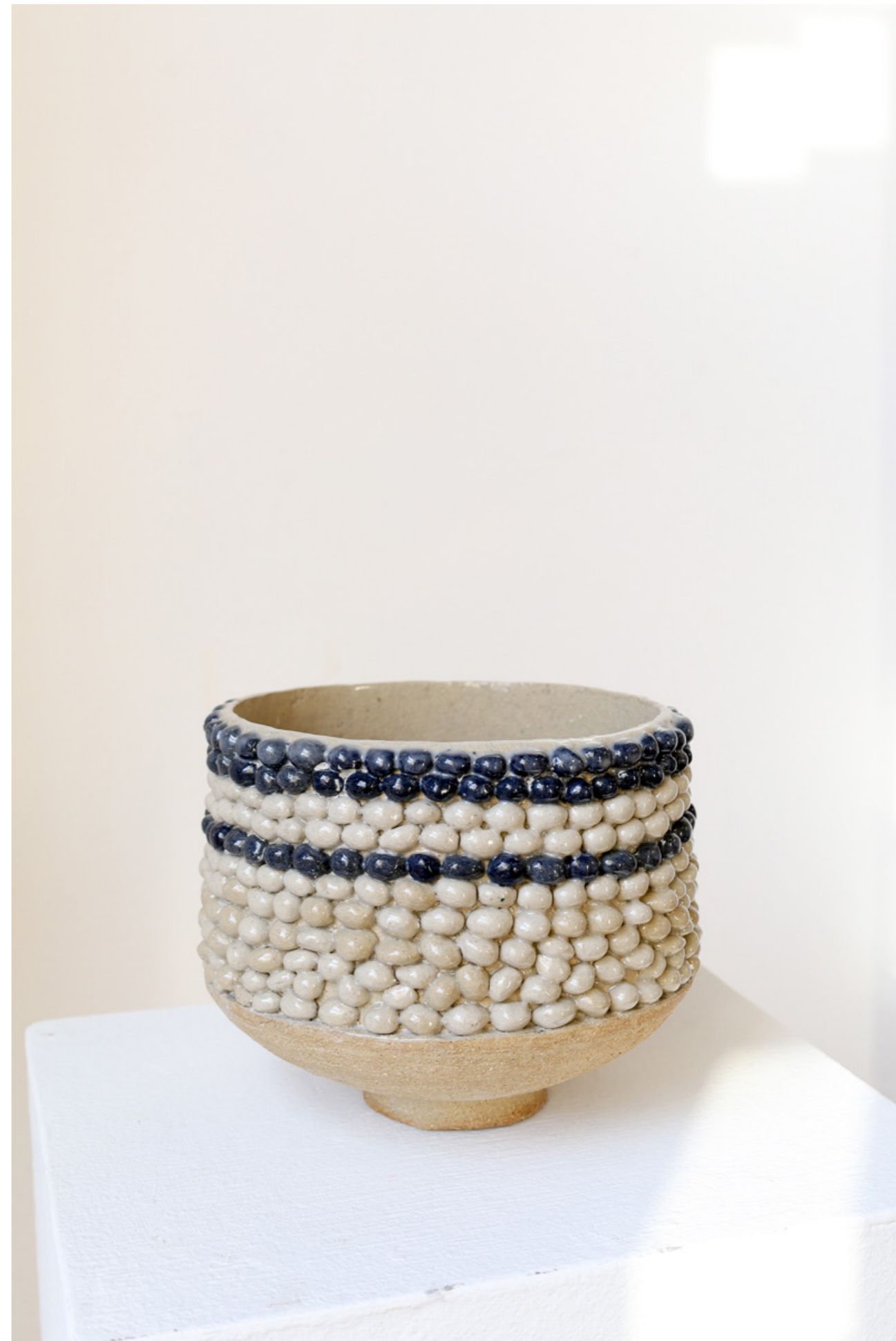
Χαλίκι I (The way we walk on it) Stoneware 27 x 25 cm