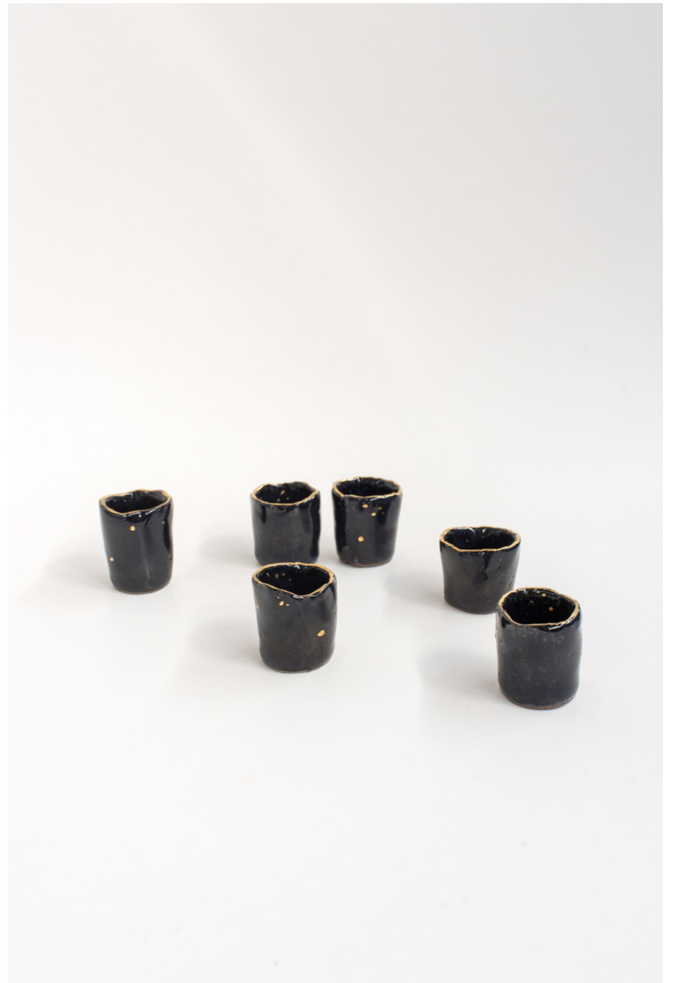
Little cups in harvest stoneware, cobalt glazed, gold - 3x5xcm