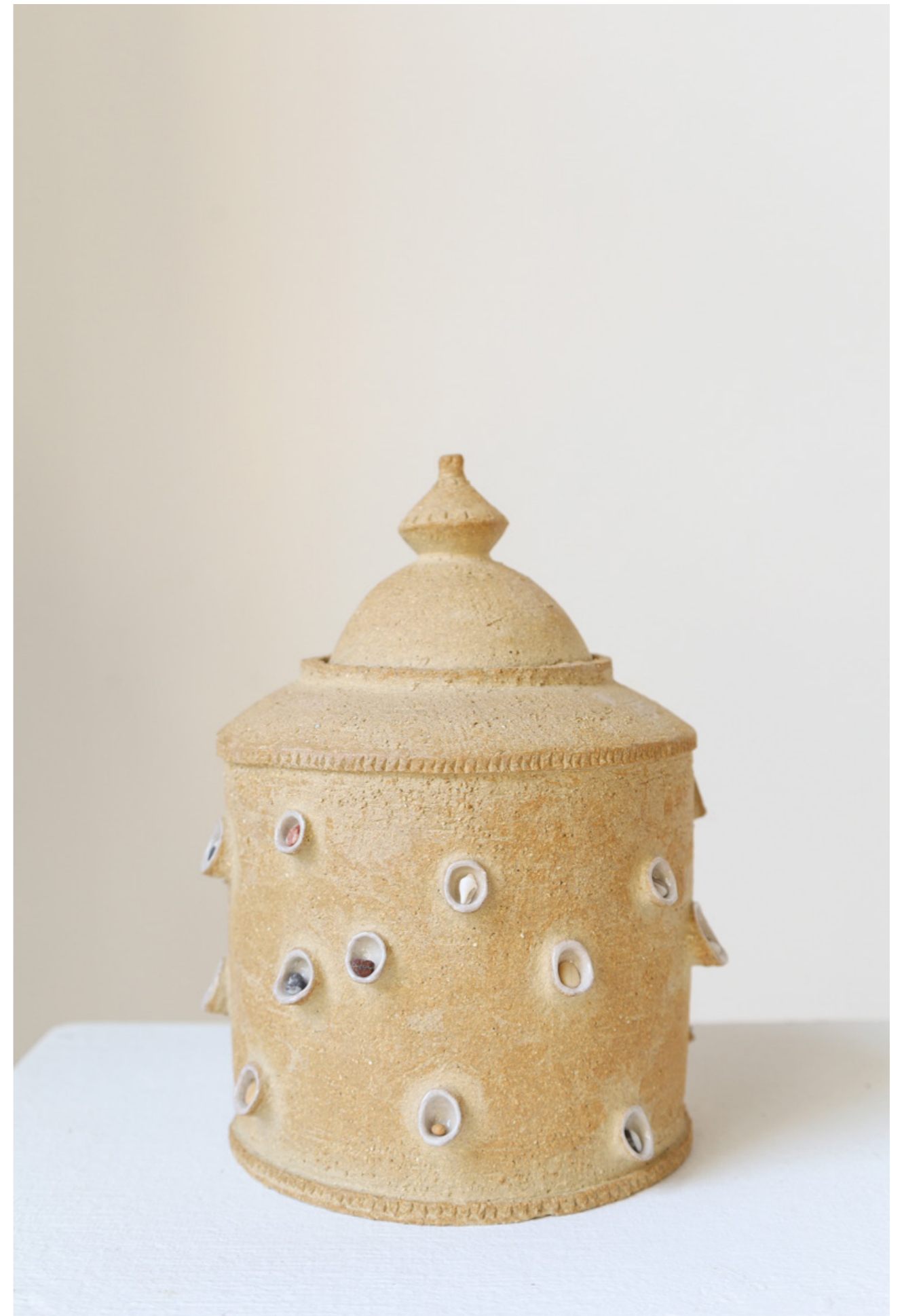
Boite aux trésors Stoneware, gold, rocks, shells 23x16 cm