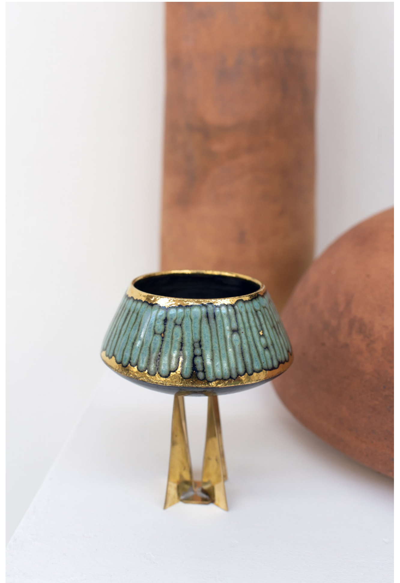
Bowl in stoneware, glaze, gold, brass legs 10cm diamètre x 15cm hauteur