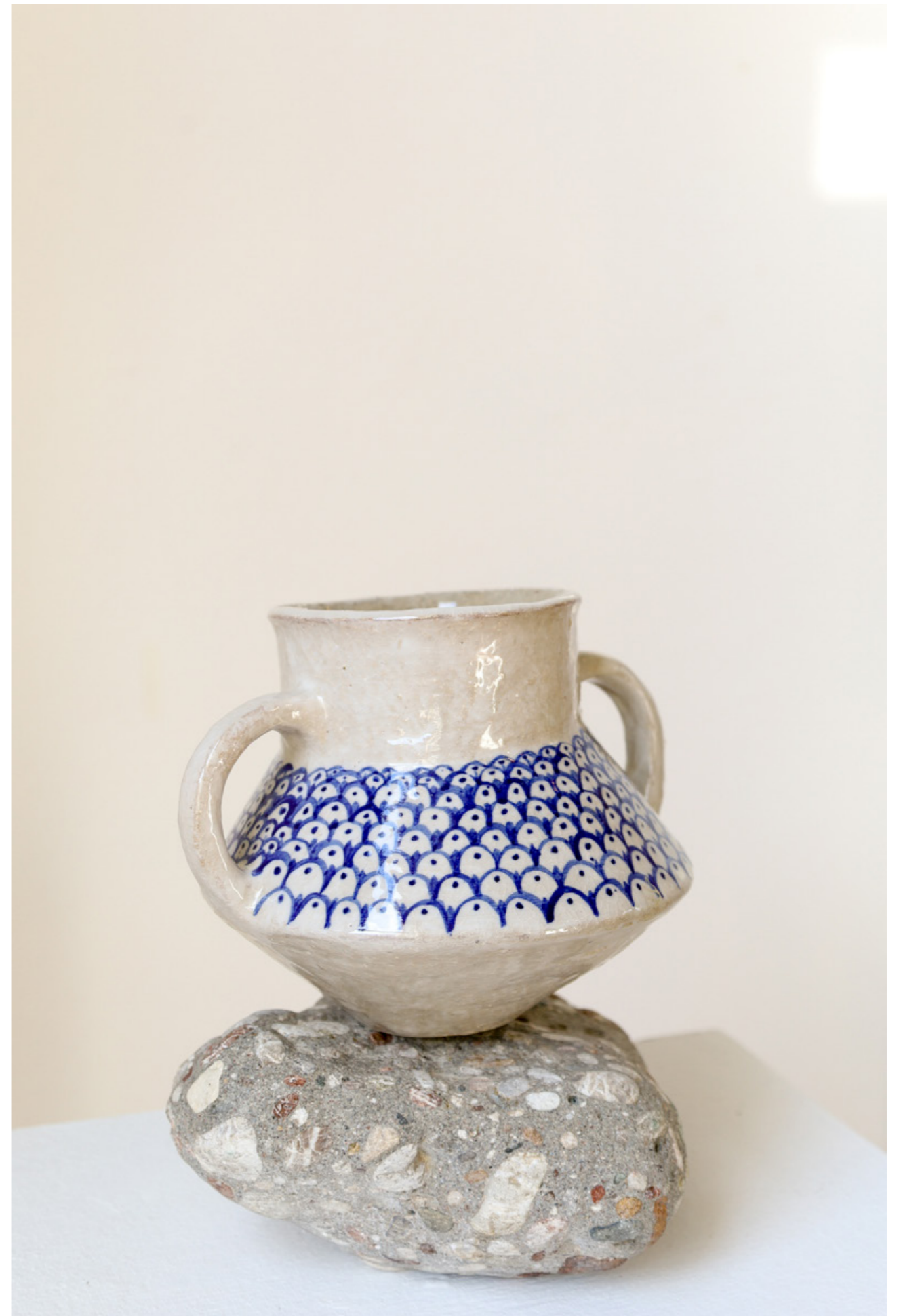
Καλλιθέα Stoneware, porcelain, cobalt 15x19 cm