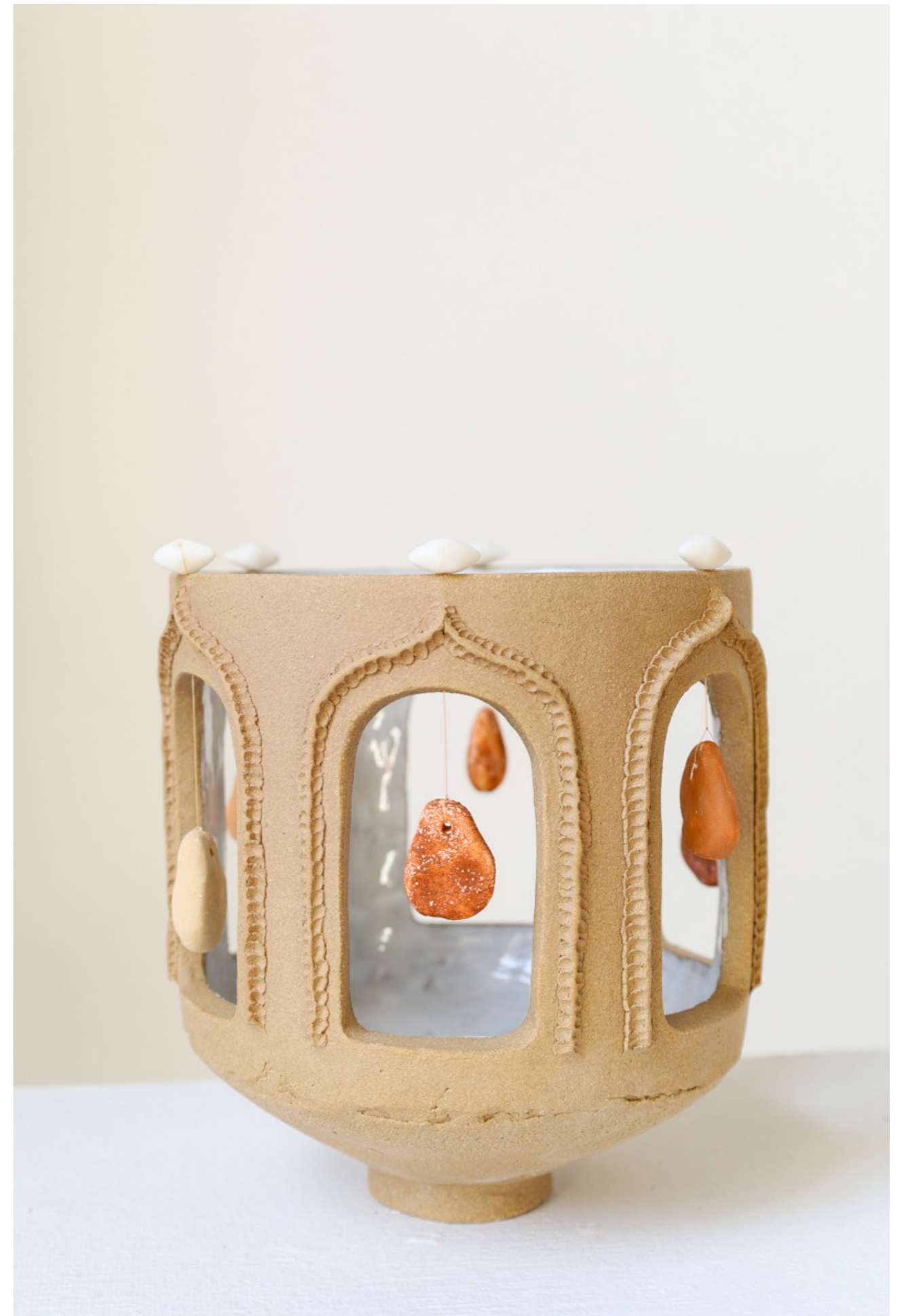
Vase with doors and weight Stoneware, porcelain, glaze, wild clay 20 x 17 cm