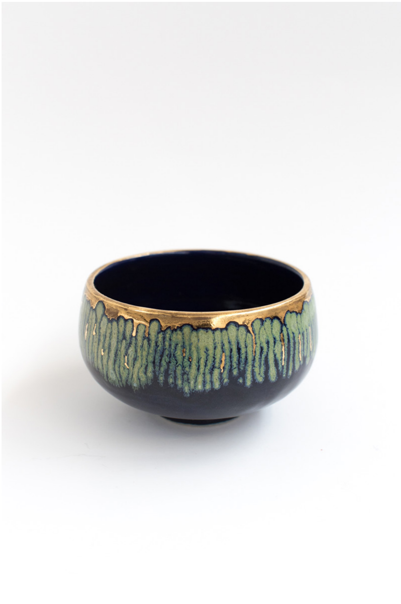
Stoneware bowl, glaze, gold 7x13cm