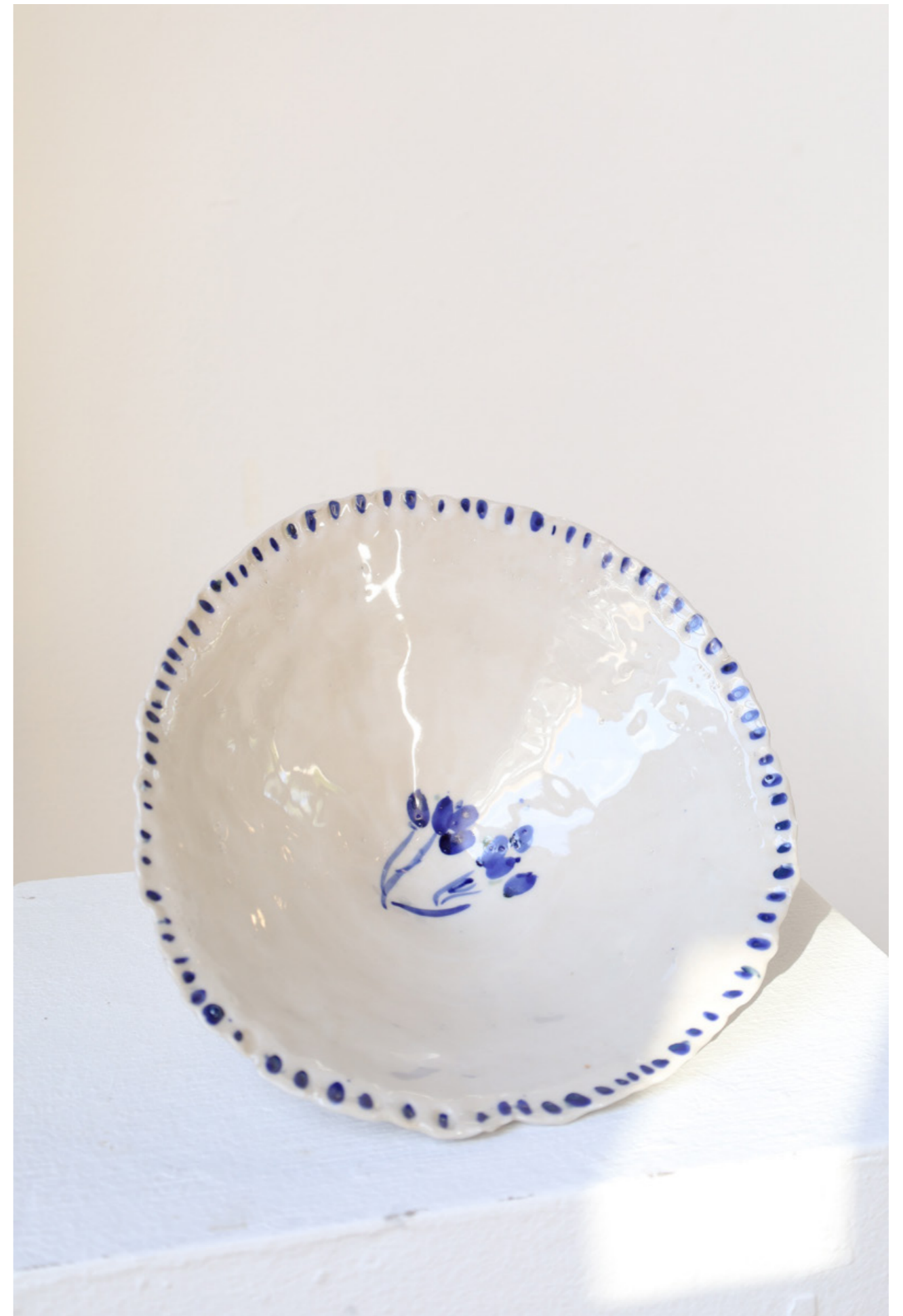
Plat à fleurs Stoneware, porcelain, cobalt 27x11 cm