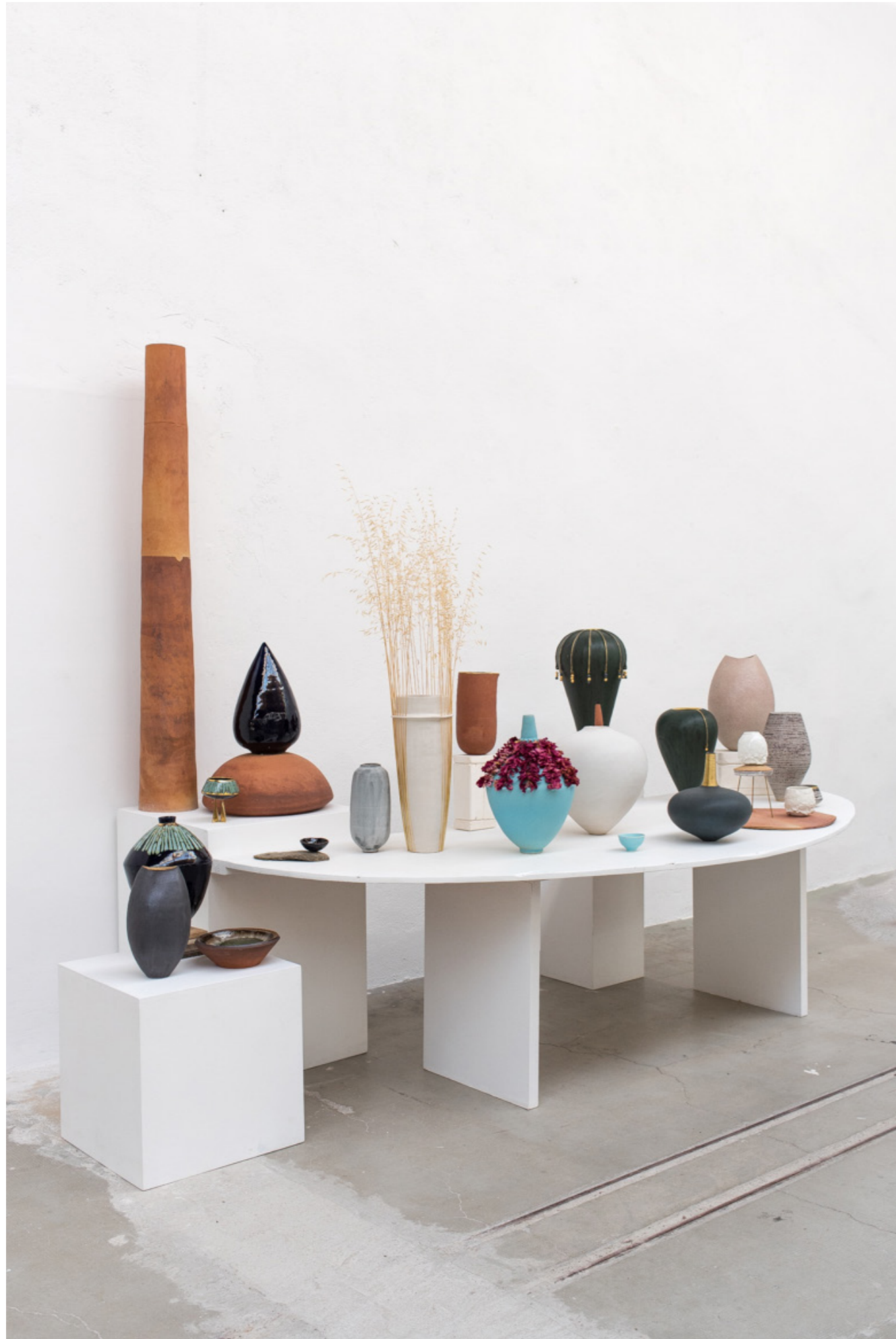
Installation view for my diploma exhibition Dieulefit, France

Bare stoneware, glazed stoneware, porcelain, brass, petals, grasses, gold