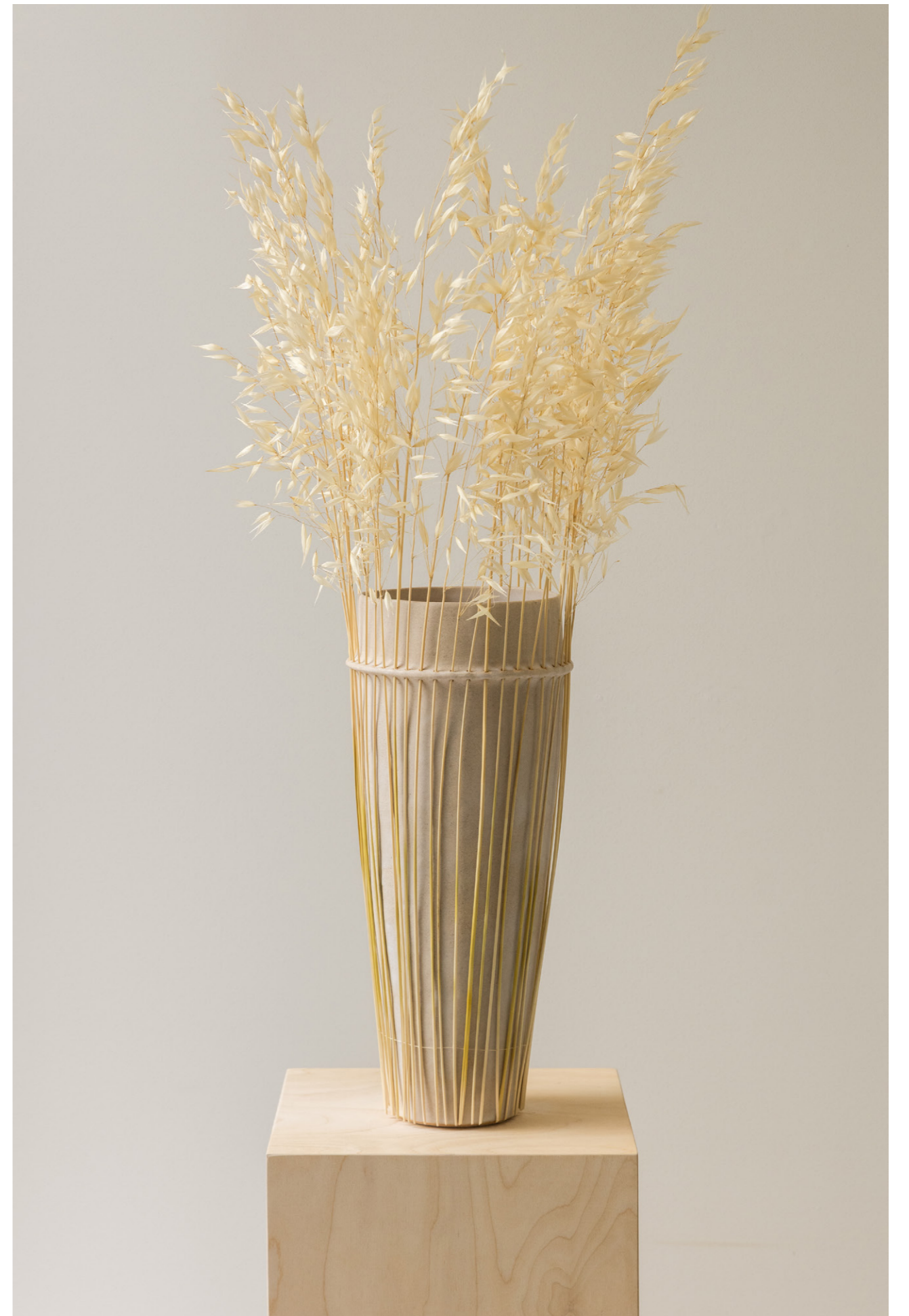
Vase aux graminées Stoneware, glaze, dry grass, gold 49x20cm