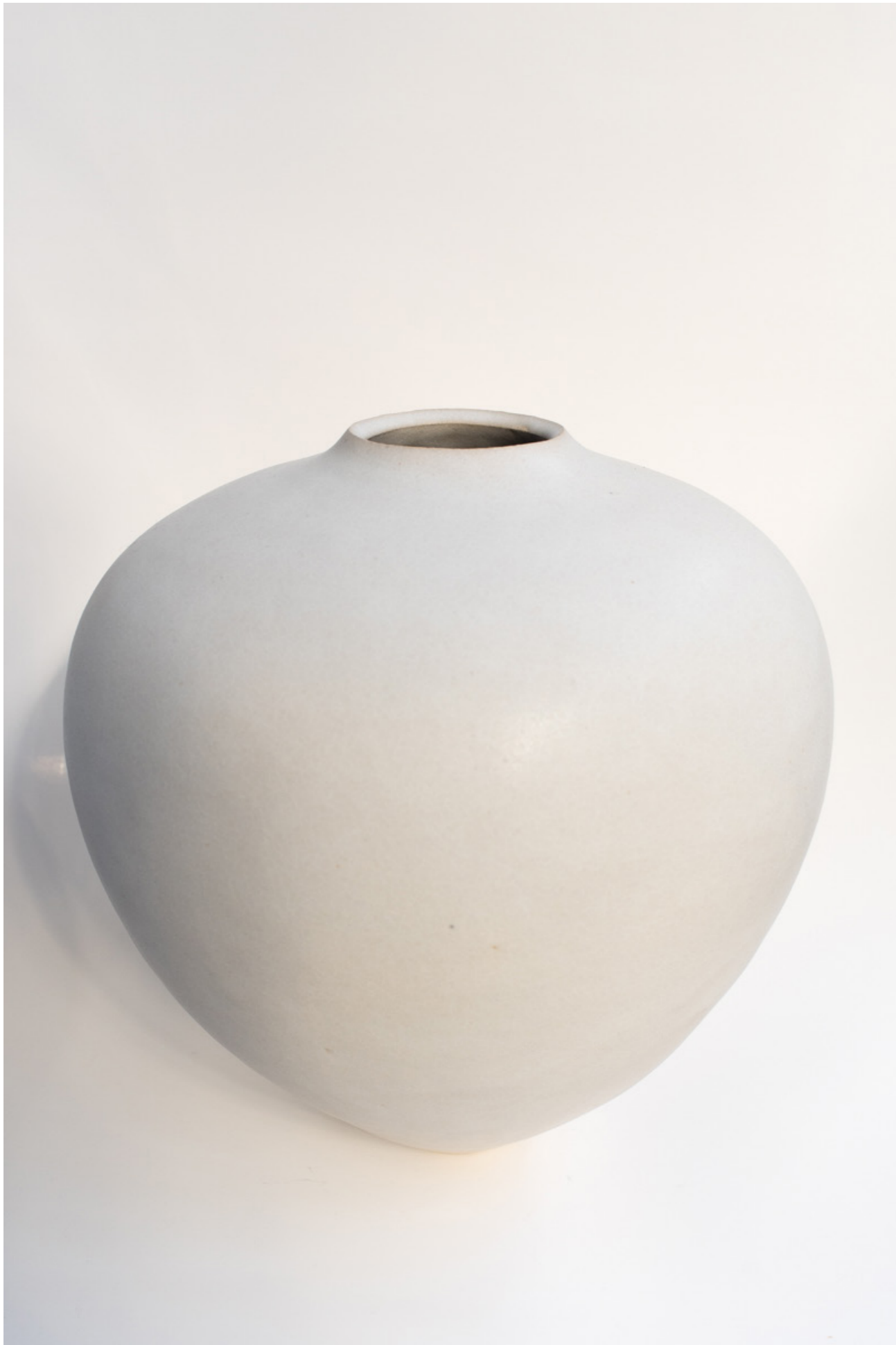
Stoneware moonjar, glaze 43x35cm