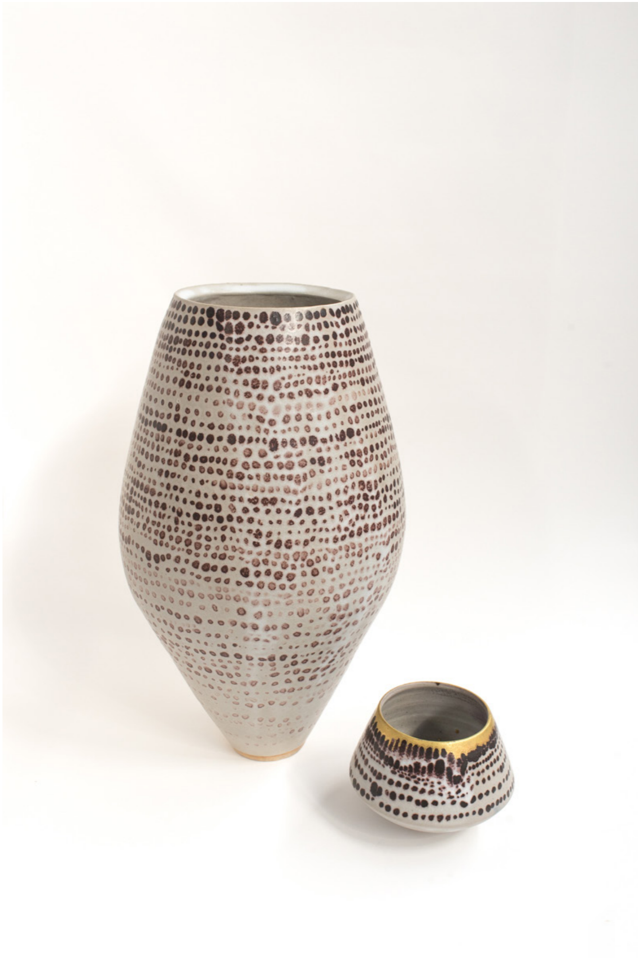
Stoneware vase, glaze, gold 46x20cm & 7x12cm