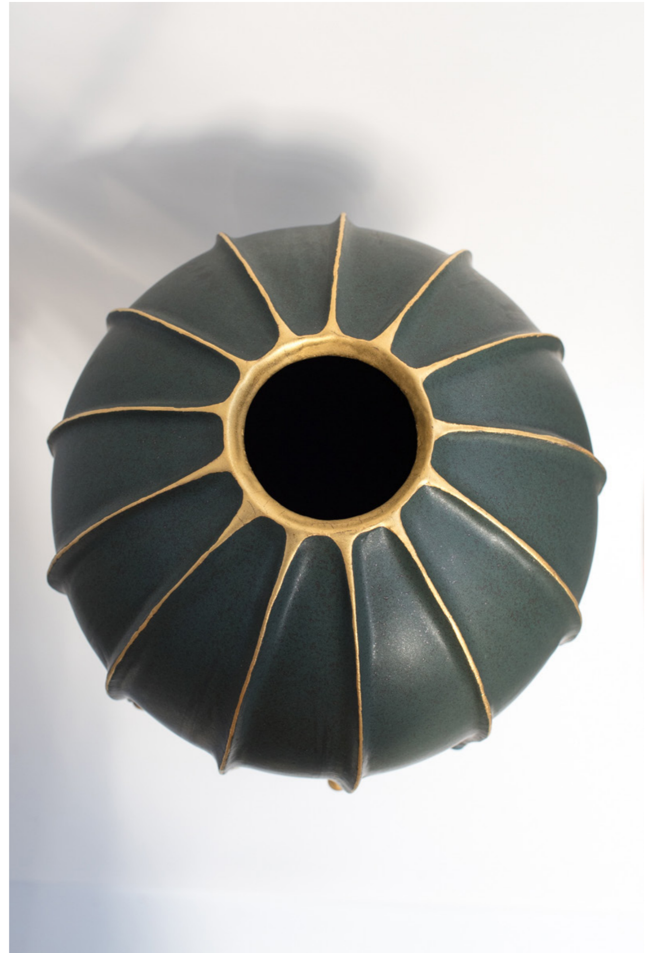
Stoneware details, glaze, gold